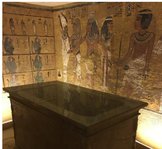
Figure 4. The replica tomb of Tutankhamen at Carter House

a few. Today the potential role replicas can play continues to expand to now serve specific conservation objectives ranging from the creation of an archival and documentary record of a site for posterity to alleviating pressure from mass tourism by drawing tourists away from the actual site. The growing prominence and use of replicas in the cultural heritage field urges us to take a more careful and nuanced look at the commissioning, fabrication and application of these objects.