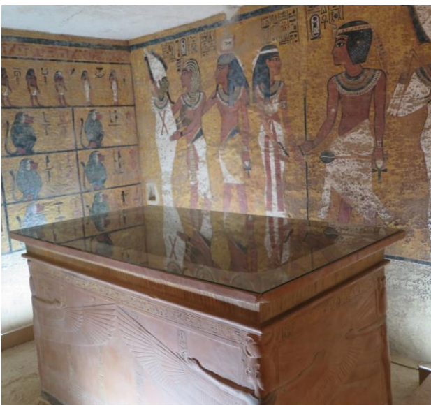
Figure 3. The tomb of Tutankhamen, Valley of the Kings