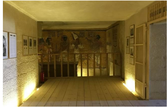
Figure 8. View of the antechamber looking north to the burial chamber in the replica tomb

Though the resulting replica has high fidelity in terms of its geometric form compared to the original with accurately replicated 3D surface texture, the digitally printed painted surface provides little information on material composition and traditional techniques of execution used (see Figure 5-6). Why was the decision made not to use materials similar to the original? Because of this difference in material composition, as the original and replica tomb age the differences between the two will become more and more apparent.