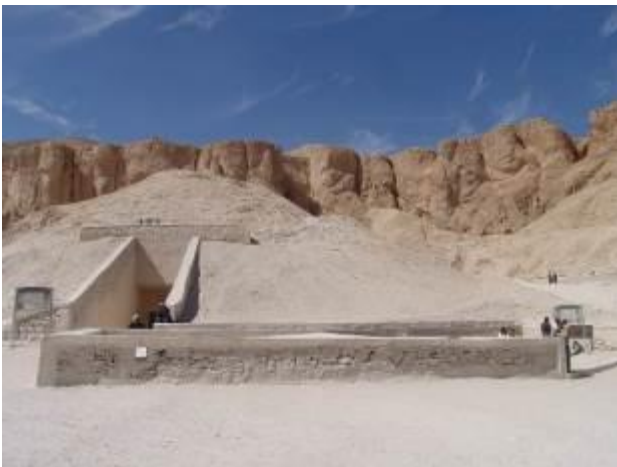
Figure 1. The entrance to the tomb of Tutankhamen, Valley of the Kings