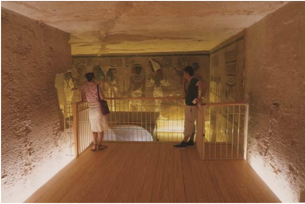
Figure 7. View of the antechamber looking north to the burial chamber