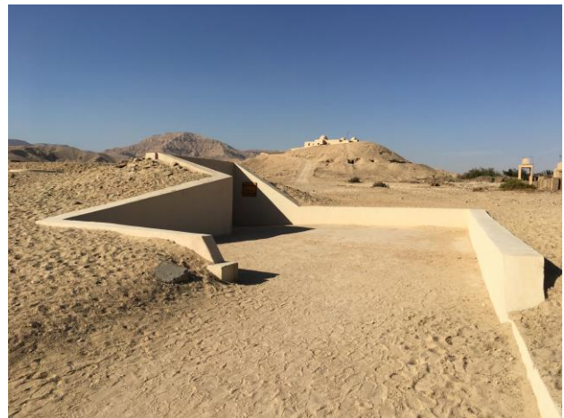
Figure 2. The entrance to the replica tomb of Tutankhamen at Carter House