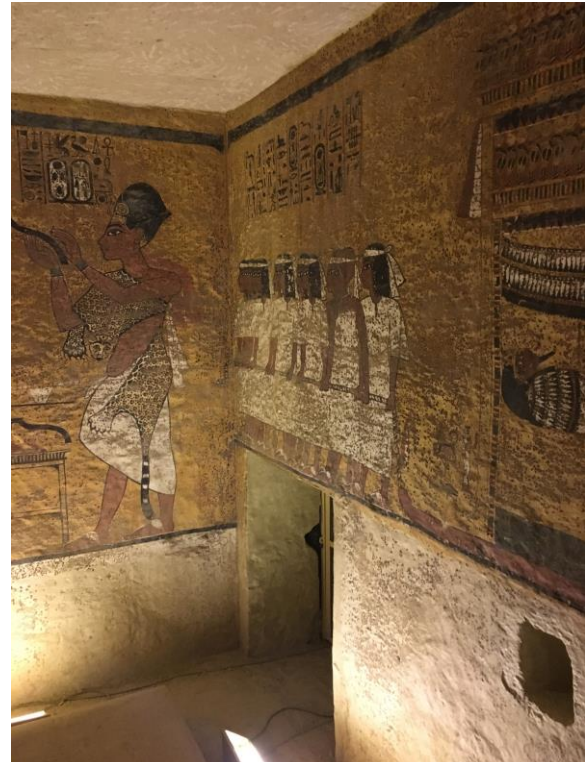
Figure 6. The northeast corner of the burial chamber of the facsimile of the tomb of Tutankhamen

During the collaborative project to conserve the tomb, between the Getty Conservation Institute and Egypt's Ministry of Antiquities, the principal focus was the design and implementation of an integrated conservation and management plan for the tomb and its wall paintings.