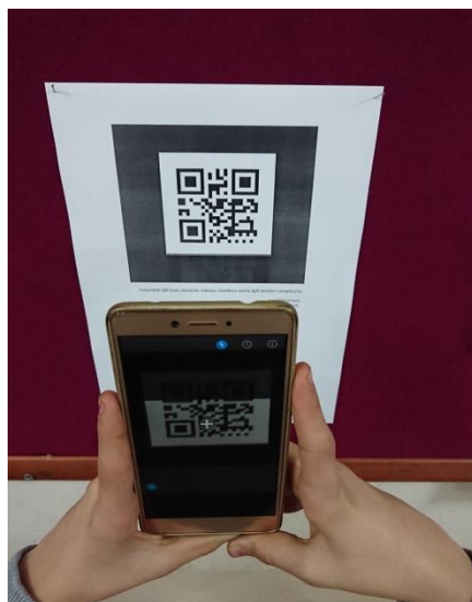
Photo 2. Sample Activities for Augmented Reality Applications (QR Code-Based Applications)

Somyurek (2014) lists the main application areas of augmented reality as follows: