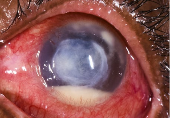
Figure 1 Microbial keratitis with ciliary injection, corneal infiltrate and a hypopyon. This patient also has satellite lesions superiorly

A corneal abrasion (Figure 3) may develop into microbial keratitis. At primary level, give chloramphenicol