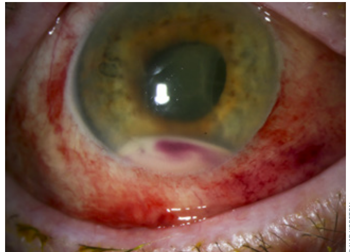
Endophthalmitis. The eyelids are swollen, the eye is red and a hypopyon is clearly visible.

Note: Use a new syringe and a new 30-gauge needle for each drug. Do not mix drugs together in the same syringe.