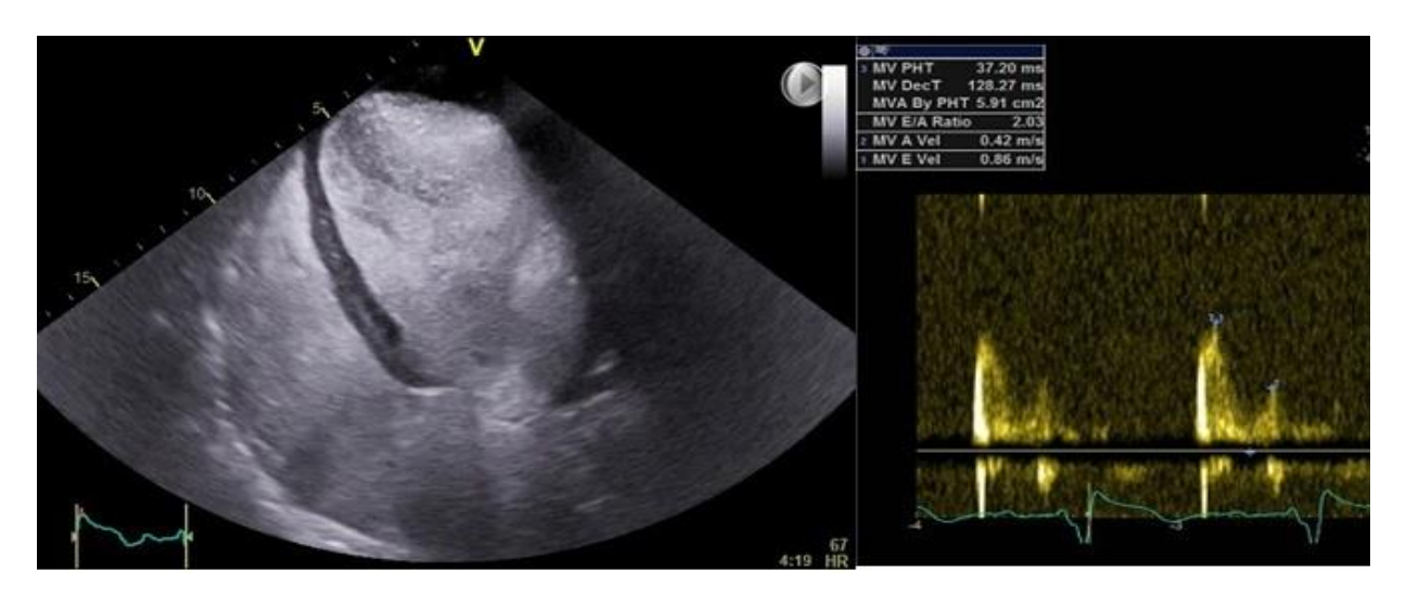
Figure 3. Echocardiogram at presentation demonstrated severe left ventricular dilatation with increased filling pressures.