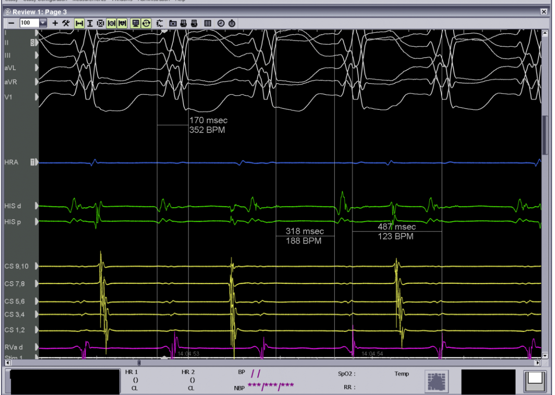
Figure 5. Clinical tachycardia reproduced at electrophysiology laboratory. CL=487ms, HV= 318ms and AV dissociation confirming the diagnosis of bundle branch reentrant tachycardia