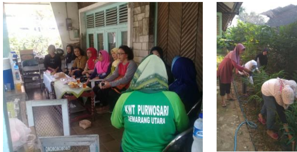
Fig 7. Social Gathering of UA Communities

Thus, the UA must emerge from an understanding of the social groups involved, the institutions that create their environment, and the space in which they are lived. As an innovative approach, UA must continue to evolve. Moreover, UA is a process that should not end with the creation of an urban garden but should continue to grow as needed, while its effects and impacts are monitored. The success of UA implementation can be improved, so there is an opportunity to scale up and increase the number of beneficiaries. The vision of UA implementation can arise, not only a vision for doing UA activity but also changes in social structure for the benefit of marginalized social groups [12]. Changes to social gatherings in UA Communities can be seen in Figure 7.