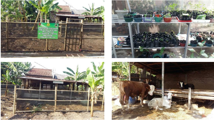
Fig 4. KRPL Program by Tandang Livestock Farmer Group