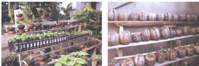
Fig 8. Utilization of waste as a planting medium

UA has a positive impact on the environment as it improves air absorption by greening urban environments while increasing recycling potential by reducing the volume of organic food waste through compost [13]. Utilization of used bottles and plastic waste as a planting medium also helps reduce plastic waste. UA offers the potential for a win-win solution where the major urban management problems that are waste disposal can be handled at the same time as increasing food security through the optimizing waste [14]. Figure 8 shows that waste can be used as a planting medium in UA activities.