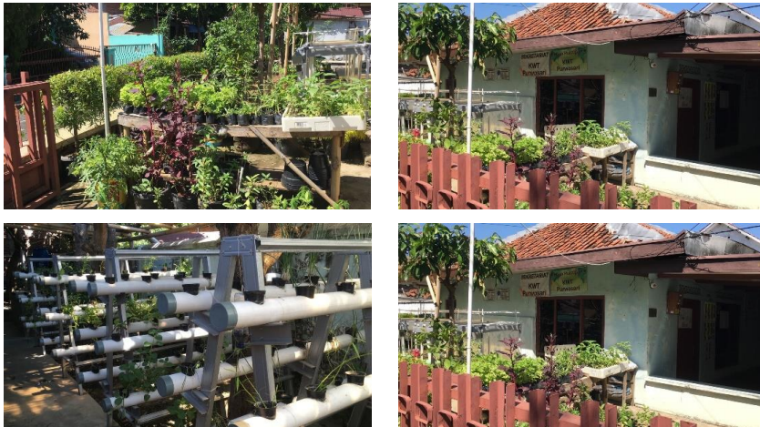
Fig 3. Yard Optimization Program by KWT Purwasari

However, KWTs and KTAs experience constraints in UA activities. Some of these constraints are dependence on the government as the first initiator, depending on the group leader in the implementation of the UA, and lack of local champion within the community groups who intend to continue UA. Another obstacle is lack of access to technology, especially the use of hydroponics as a planting medium. Many hydroponics is not running, because people do not know how to operate them.