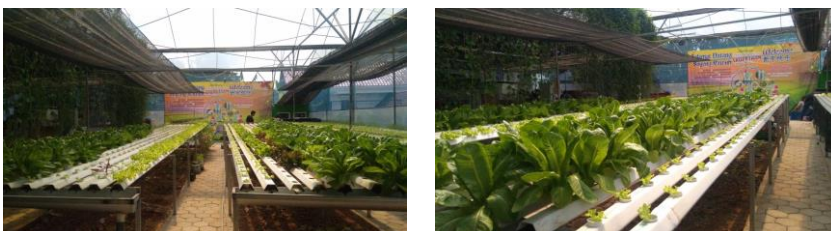
Fig 5. Individual Initiatives on Urban Agriculture by Crispy Farm

The availability of the land is widely used by individuals/communities who want to do UA activities. For example, Crispy Farm Corporation which is located in Gedawang sub-districts, Banyumanik. Crispy Farm was first developed by a housewife whose hobby is planting crops. By utilizing a land of 500 m 2 and using a greenhouse with hydroponics as a planting medium, the owner managed to expand her crop production to sell to many supermarkets in Semarang, Solo, Magelang, and Yogyakarta. Crispy Farm's sold commodities are vegetables and fruits, such as lettuce, tomatoes, and melons. The commodity is selected, due to the high selling value and more easily produced. Figure 5 shows the activities in Crispy Farm.