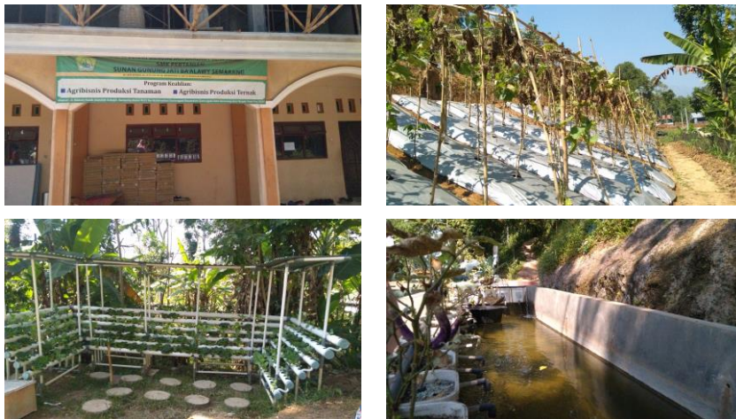
Fig 6. Initiatives for Urban Agriculture in Pesantren Sunan Gunung Jati Al Ba'alawy

The pesantren has succeeded in harvesting and selling its harvest to the market every morning by pesantren students. One of the most popular crops is Walindo ( Waluh Indonesia/Indonesian Pumpkins ). The pesantren also sells many vegetable crops such as lettuce, celery, tomatoes, and eggplant. The type of urban agriculture which is managed in pesantren diverse from aquaponic, hydroponic, or planting in terraces. The activities of UA in Pesantren Sunan Gunung Jati Al Ba'alawy can be seen in Figure 6.