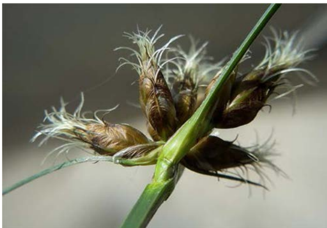
Fig. 2. Inflorescence of B. planiculmis with predominantly bifid styles.