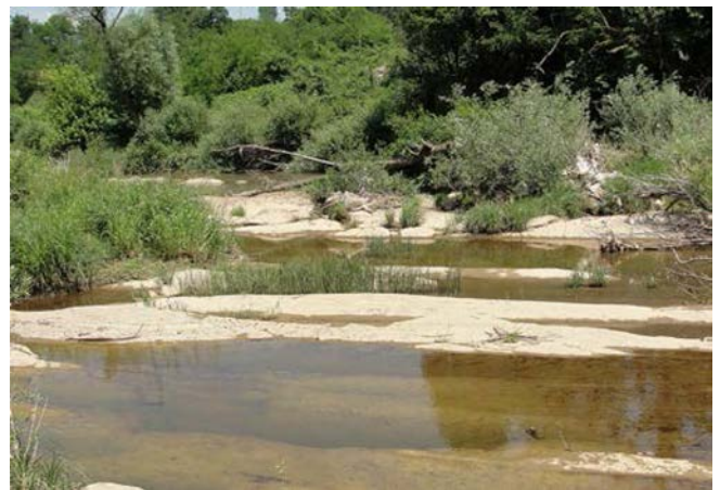
Fig. 3. Habitat of B. planiculmis at the locality of Blizansko polje (photograph taken by Š. Šarić).

herbarium vouchers was studied in the field during the last 5 years in order to collect herbarium material necessary for revision. In that way, we collected material sufficient for revision of known literature records and are now able to refer all published data to at least one herbarium voucher specimen.