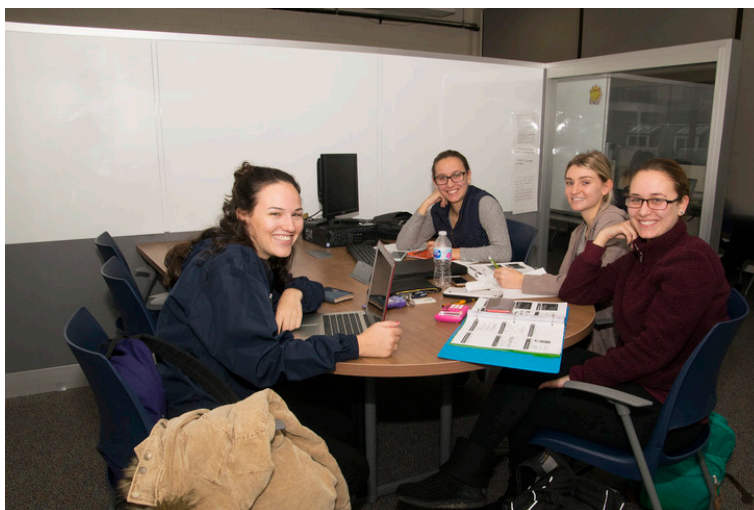
Pods feature writable walls and plenty of ports and privacy for Abington students to successfully collaborate.