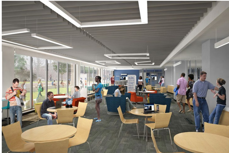
Pattee Library's entire ground floor west will be renovated and renamed the Collaboration Commons. Ample electrical outlets will encourage students to "bring your own device," while group study rooms, bar-height table seating facing campus views, open seating areas, and a flex-use multipurpose room with mobile furniture will provide a variety of configurations for groups of all sizes. (Image courtesy of WTW Architects)

The Collaboration Commons will effectively increase the library's space available for group-work areas and group-study rooms, similar to the existing Knowledge Commons one floor above it. The Collaboration Commons' design includes abundant charging outlets and wireless infrastructure, more than a dozen group-study rooms, flex-use tables, mobile furniture and a section with collapsible glass walls, to give the entire floor the possibility of multiple configurations for group-study, as well as classroom and presentation options.