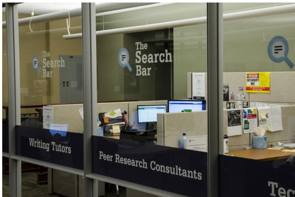
The Search Bar is the Penn State University Libraries' progressive approach to one-stop, peer-to-peer services where students are helping students with technology, writing and library assistance in Sidewater Commons, first floor central Pattee Library.

information sources, help students express themselves clearly in the writing process, and provide help with course assignments requiring technology. Students often seek assistance from more than one consultant in a visit, which is easily accommodated by the Search Bar.