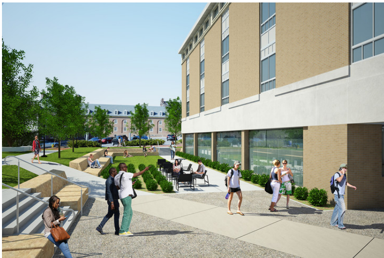
A renovated terrace and entrance to the ground floor of West Pattee Library, which will be completed in summer 2019 as the final portion of the project, will open views from a new Collaboration Commons and add outdoor seating and gathering space. A gentle slope will improve accessibility to the building entrance.

The third floor's infill space will centralize three Digital Scholarship and Data Services units, which include Digital Humanities Services, Research Data Services and Scholarly Publishing Services. Research Data Services oversees the University's repository, ScholarSphere, and provides expert guidance for advanced research services such as data management planning, statistical consultations, geospatial mapping and analysis, data archiving and preservation, and funding agencies' public access policies.