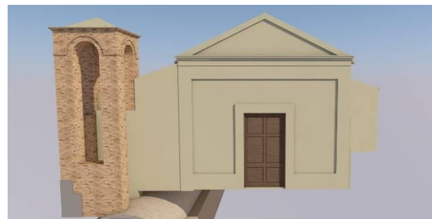
Figure 8. Reconstruction of Building Information Model