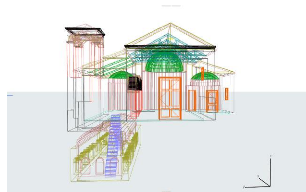
Figure 9. Reconstruction of Building Information Model