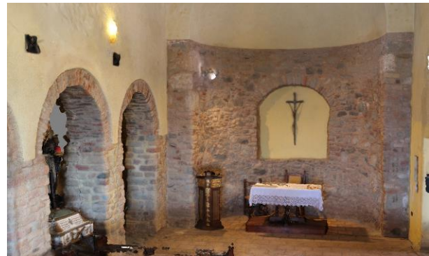
Figure 4. 3D Model - inside

The workflow followed to generate the parametric model of the church started from the digital photogrammetric survey of the building, then the already described process for the generation of the 3d point clouds and related texturized meshes were executed. This procedure was also replicated inside the building. The two obtained point clouds (internal and external) were then combined with the 3d software Photoscan using common key points reported on both point clouds (i.e. main entrance, pavement, wall). Then, the complete mesh model inside and outside of the church has been elaborated and a complete 3D model (mesh and texture) was realized. The obtained 3D model although excellent in geometrical terms, did not guarantee the possibility to manage each element separately.