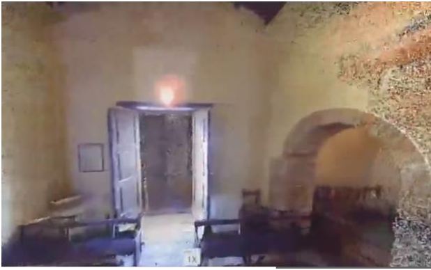
Figure 5. Sant'Antonio Abate Church – Union of clouds