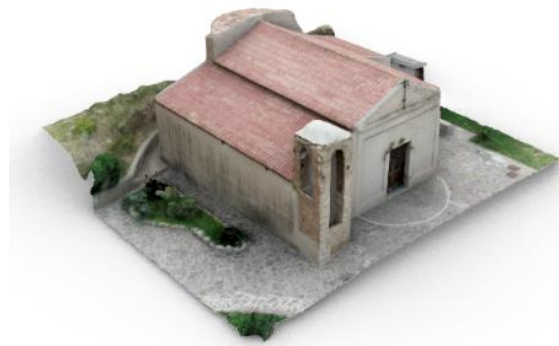
Figure 2. Perspective view of the reconstructed 3D Model – outside