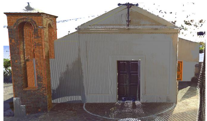
Figure 7. overlap between BIM and Dense Cloud