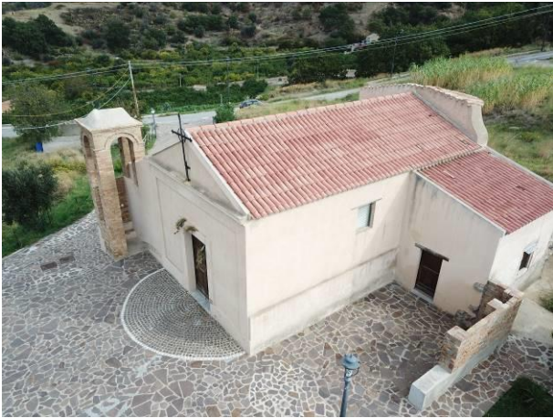
Figure 1. Sant'Antonio Abate Church