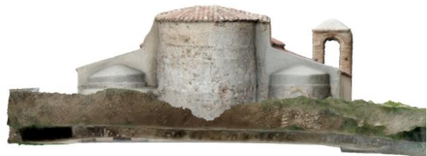
Figure 3. South view of the reconstructed 3D Model – outside