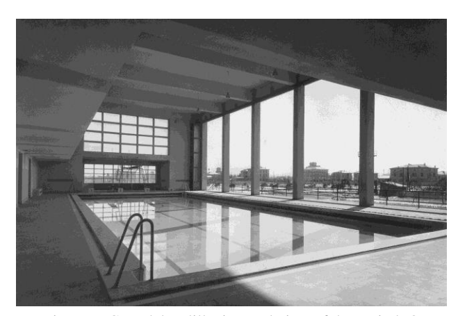
Figure 6. Casa del Balilla, internal view of the period.

Furthermore, the setting up of the Santarelli Kindergarten will allow the narration of its main historical and constructive events. From here, the routes in the city can then branch out. Nevertheless, the visit path of the open-air museum will have an additional starting point: the Casa del Balilla (Figure 6). Located along the railway station boulevard, the building is the legal address of ATRIUM. From here, the guided tours will be able to start.