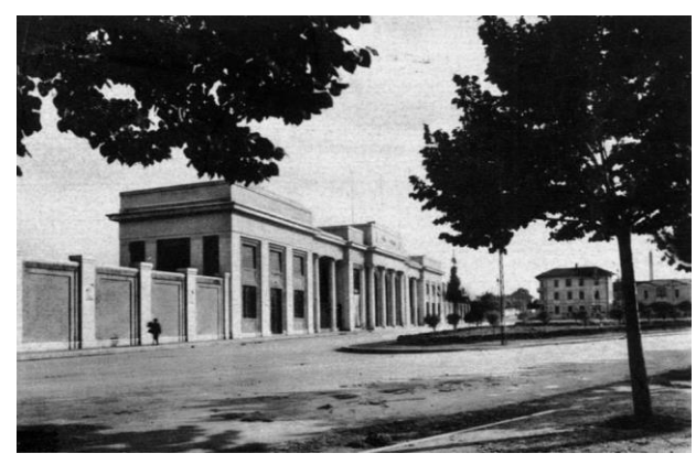
Figure 3. Foro Boario.

When completed the threads of research, how to manage this amount of information and above all giving the keys to simplifying the access to them, to foster their use and comprehension instead of discouraging it, become the primary objective to pursue.