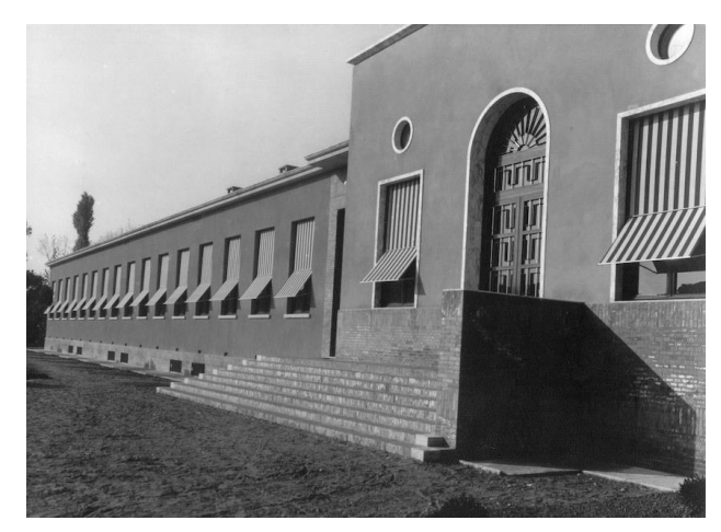
Figure 1. Santarelli kindergarten.

finding an interpretative key for these objects, bearers of an "uncomfortable" memory the cooperation started with the development of a pilot project regarding three architectures considered iconic for this context but also able to foster more complex urban policies. The choice was on buildings whose preservation was jeopardized by the abandon or the lack of maintenance: the former Santarelli kindergarten, the former Aeronautical College and a former cattle market known as Foro Boario.