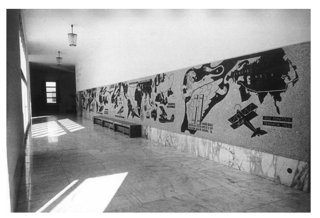
Figure 2. Former Aeronautical College. Mosaics.

The paths established, apparently very divergent for expected outputs and results, started instead from the same cultural activity, which consisted precisely of recording and managing the documentation regarding the whole lifecycle of the three buildings selected: the former Santarelli kindergarten (Figure 1), the former Aeronautical College (Figure 2), Foro Boario (Figure 3). This process of research, acquisition, and organisation of data should be integrated into the entire conservation process, from its preliminary stages for continuing even after the completion of the intervention (Whalen, 2017).