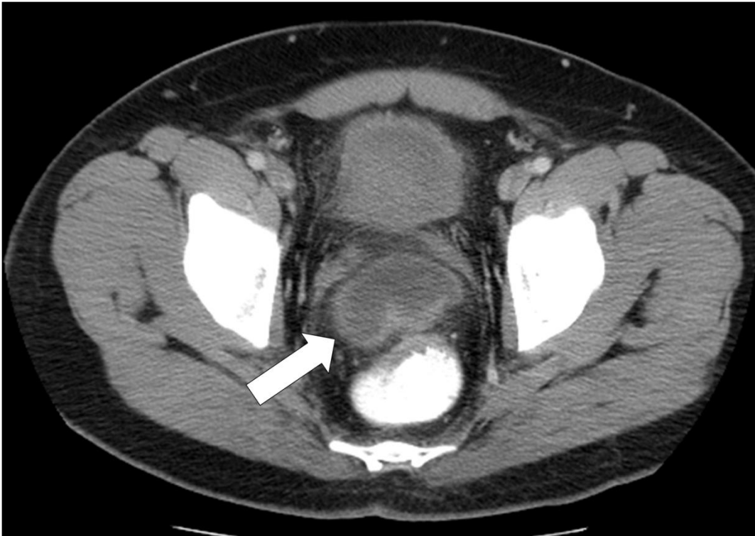
Figure 1: Axial CT of the pelvis: Oral contrast is noted in the rectum. A rim enhancing abscess (arrow) is visualized anterior to the rectum.

The abscess cavity was identified <1cm from the anterior wall of the colonic lumen and extended towards the right lower quadrant. Using a 19-gauge FNA needle the abscess cavity was punctured and 15mL of purulent material was drained; following which, contrast was injected and the abscess margins were visualized with fluoroscopy. A guide wire was passed through the FNA needle and coiled in the abscess cavity under fluoroscopic guidance. An over-the-wire 10mm x 4cm dilation balloon (Boston Scientific – Hurricane RX) was used to dilate the tract and evacuate copious amounts of pus into the gastrointestinal lumen. Following complete decompression of the abscess cavity, a 10 French x 3cm double pigtail stent was inserted to facilitate further drainage. The position of the stent was confirmed endoscopically and radiologically. The endoscope was withdrawn and the procedure was terminated without any complications.