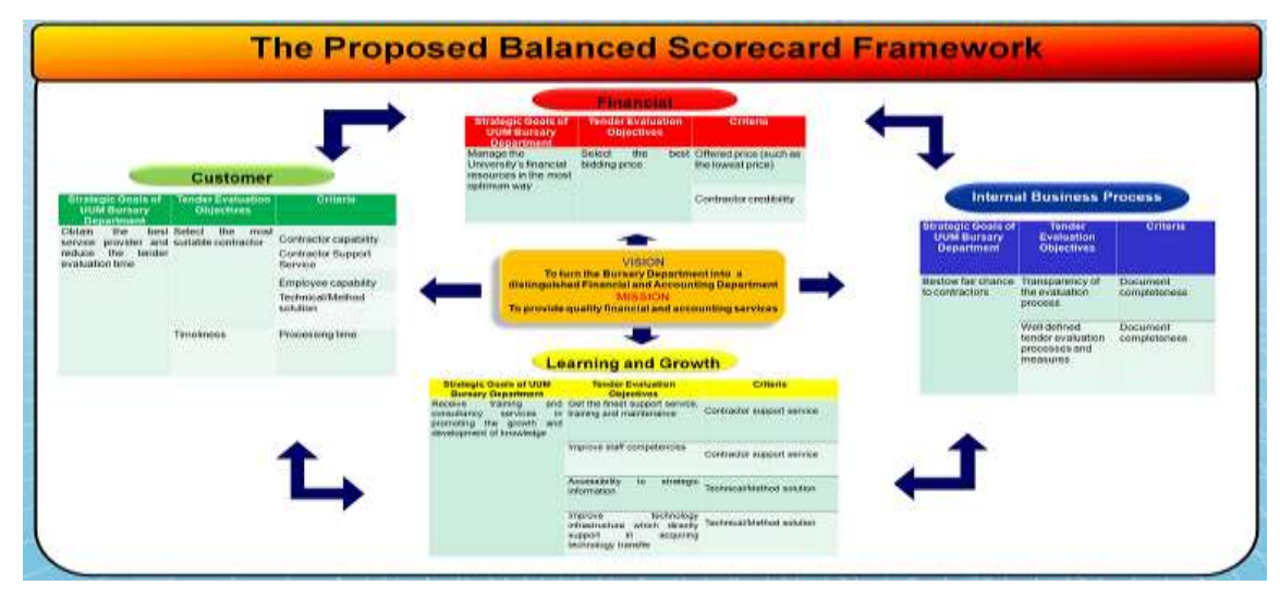
Figure 1. The proposed Balanced Scorecard Framework for IT project Tender Evaluation