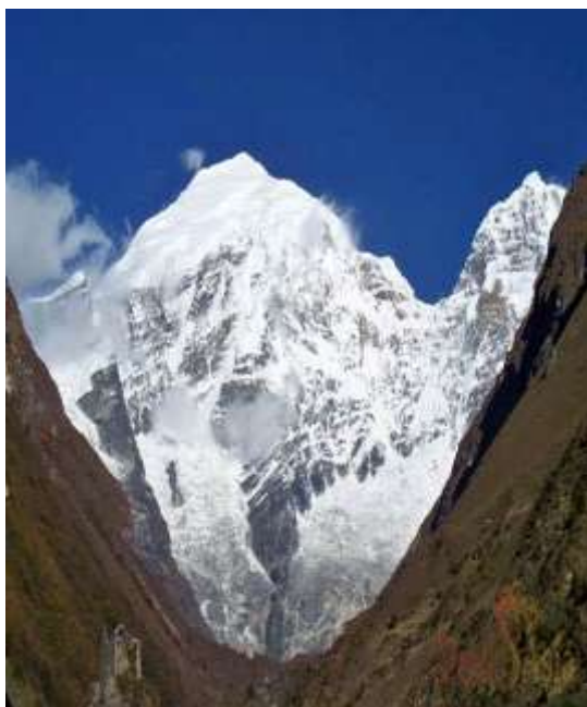
Figure 2: Main tourist attraction