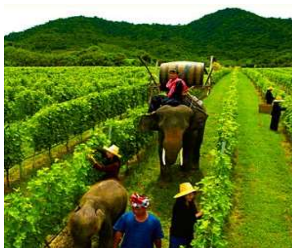
Image 1. Hua Hin Hills Vineyard