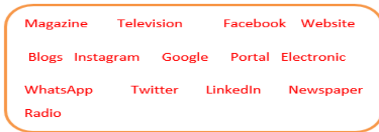
Figure 1.1 Media for tourism destination marketing

The responses from the participants helped in establishing the main types of media that are most commonly used in the marketing of tourism destinations. Some of the participants informed that they have used the media and others have witnessed the media being applied in various tourism marketing set-ups. The main informed types of media are as shown in Figure 1.1 below.