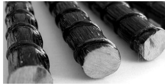
Fig. 4. BFRP bars [7]