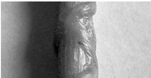
Fig. 1. GFRP bar [7]