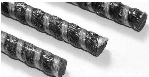
Fig. 2. CFRP bars [8]