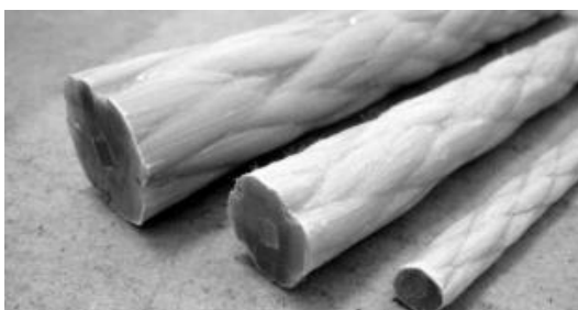
Fig. 3. AFRP bars [9]