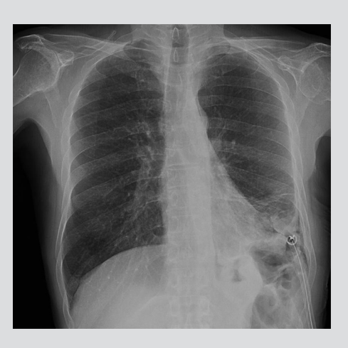
Figure 2. Postero-anterior chest x-ray showing a chest tube in the left hemithorax and a significant decrease in the pleural fluid seen in Fig. 1

Blood tests showed moderate elevation of C-reactive protein (94 mg/dl; normal <2.9), high-sensitivity cardiac troponin I (0.737 ng/ml; normal <0.045) and N-terminal fragment of pro-brain natriuretic peptide (NT-proBNP) (5,579 pg/ml; normal <900). An electrocardiogram showed symmetrical inverted T waves in the anterolateral leads with no signs of acute ischaemia. A chest x-ray revealed BPE occupying the lower third of the left hemithorax and a smaller portion of the right hemithorax ( Fig. 3 ).