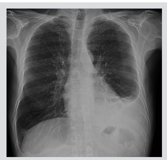
Figure 4. Postero-anterior chest x-ray showing resolution of the right pleural effusion and persistence of the left effusion seen in Fig. 3