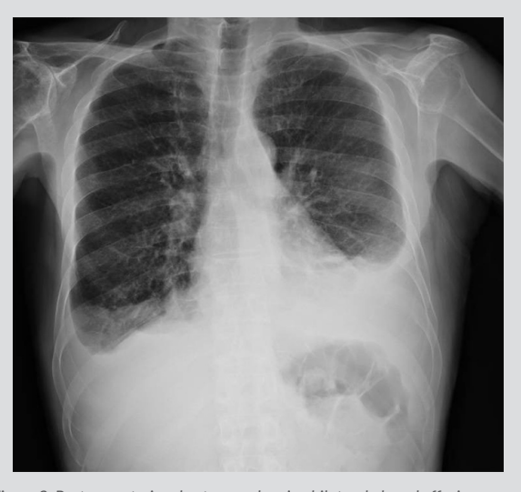
Figure 3. Postero-anterior chest x-ray showing bilateral pleural effusion occupying the lower third of the left hemithorax and in a smaller portion of the right hemithorax

After 2 days of diuretic treatment, the patient had improved significantly. He had no dyspnoea or orthopnoea. A chest x-ray showed resolution of the right pleural effusion with persistence of the left effusion ( Fig. 4 ).