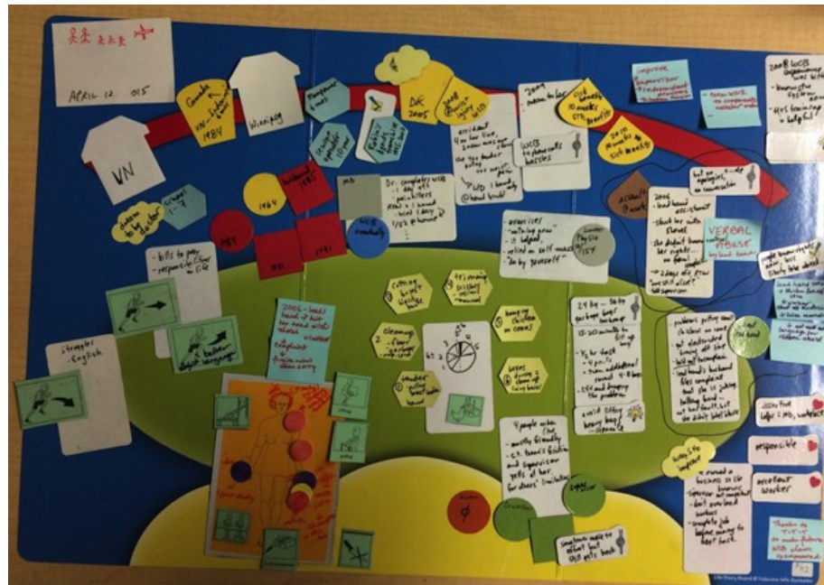
Figure 4: Life-scape example (Newcomer workers study) [3]

Introductory training to use the LSB is typically offered in one or two day small group workshops that include demonstration and experiential components. The content and process of the training may vary based on the objectives and interests of participants. The standard LSB kit includes a 40 page manual and several guide sheets that introduce LSB concepts and explain the Elements card sets, marker sets and other components. The purchase of the LSB ($300 US) is associated with a one- or two-day small group training workshop, and two to three hours of individual orientation, in-person or via web-video. [4]