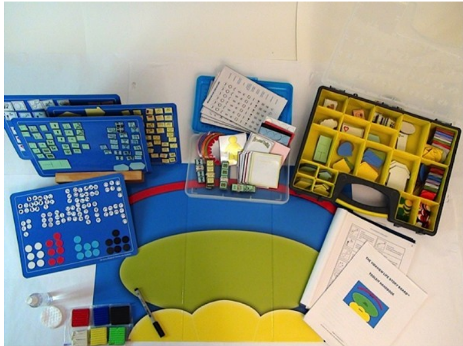
Figure 2: LSB kit