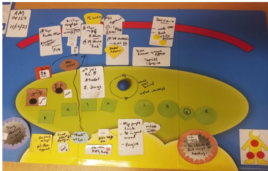
Figure 3: Life-scape example (Aboriginal males study)