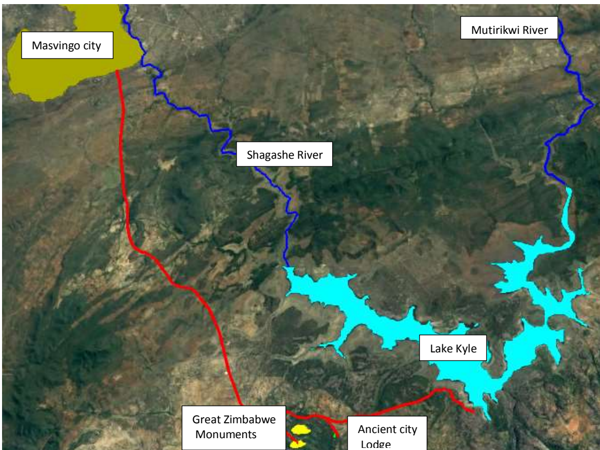
Figure 1: Map of Study Area