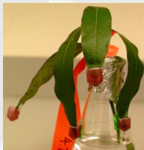
Fig. 1. Method used to inoculate Umbellularia californica leaves on small branches with Phytophthora ramorum zoospores. Zoospores were added to microfuge tubes.

Lesions within a location varied significantly among trees (Fig. 3). Variation between locations was also significant (Fig. 2, 3). Overall, leaves from Swanton Pacific had significantly smaller lesions, while those from Big Sur had significantly larger lesions.