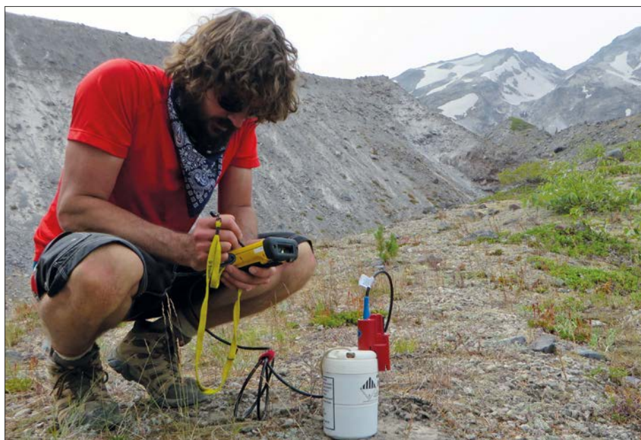
1 Small, cheap and remarkably useful: modern high-frequency seismic nodes are increasingly popular for deployments in remote areas and novel seismological situations.

In 1883, John Milne postulated that earthquake energy could be recorded at great distances (Milne 1883). This was proven in 1889 when a recording of a teleseismic earthquake (from Japan) was made by Ernst Von Rebeur-Paschwitz on a seismometer in Potsdam, Germany (Von Rebeur-Paschwitz 1889). Von Rebeur-Paschwitz soon realized that a set of seismometers deployed at stations globally could enhance