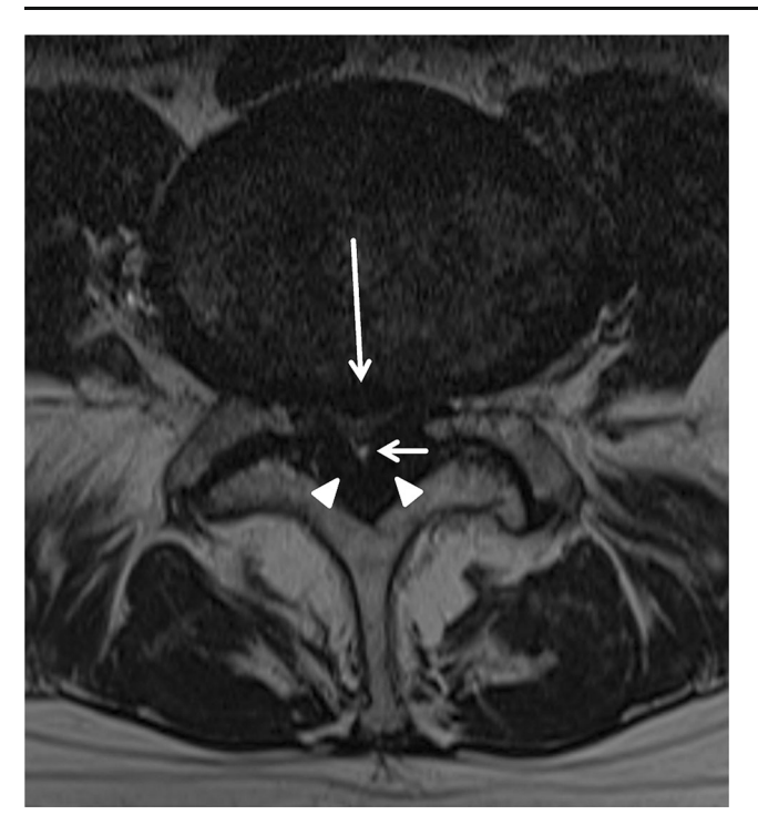
Fig. 1 Central stenosis. Axial T2 weighted MR image of the L4/L5 lumbar segment of a 71-year-old patient. According to the final set of core radiological criteria for a structured radiological report in patients with lumbar spinal stenosis, the compromise of the central zone and the relation between fluid and cauda equina should be described using the two classifications of Luire et al. and Schiza et al., respectively. Severe spinal canal stenosis with compromise of the central zone of>2/3 of its normal size due to disc material (moderate stenosis according to Lurie et al., long arrow) and bilateral hypertrophy of the ligamentum flavum (arrow heads). No rootlets can be recognized and the dural sac demonstrates an almost homogeneous grey signal with no cerebrospinal-fluid signal visible. There is minimal epidural fat present posterior (short arrow). According to the classification of Schizas et al., the relation between fluid and cauda equina can be classified as a type C, severe stenosis

research but agreed, that due to its similarity to No. 22, it should not be used.