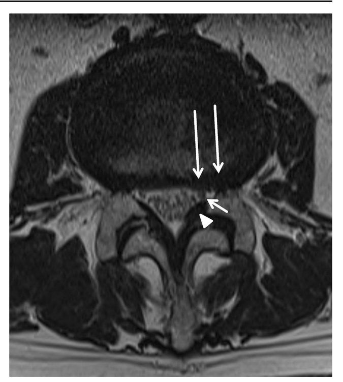
Fig. 2 Lateral stenosis. Axial T2 weighted MR image of the L4/L5 lower lumbar segment of a 67 years-old patient with left-sided accented lateral recess narrowing. According to the final set of core radiological criteria for a structured radiological report, the classification of Bartynski et al., should be used and a grade two compression should be reported. The nerve root on the left side (short arrow) is slightly compressed but with preservation of cerebrospinal fluid around the root in the recess. Reasons for stenosis are a hypertrophy of the ligamentum flavum (arrowhead) and disc material protruding in the lateral recess (long arrows)

Criteria No. 23 and No. 26 were selected as they are easy to understand by clinicians, and they consider the individual anatomical variation of patients [5, 35, 50, 67] (Fig. 3). As there are four descriptions of No. 23 [5, 35, 50, 67], the participants recommended using the scoring system from