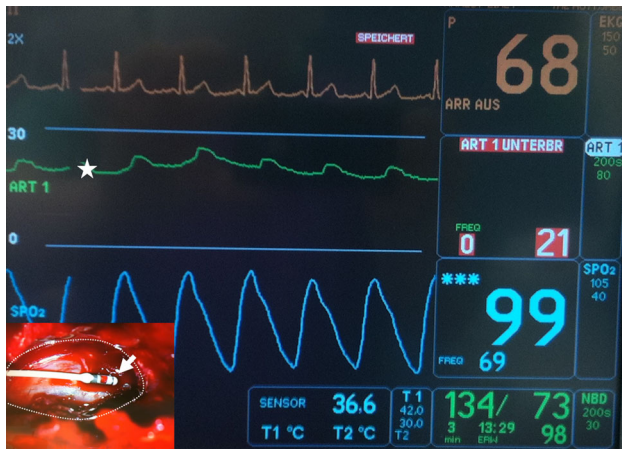
Fig. 2 Intraoperative view of patient with LSS and positive SedSign: introduction of Codman catheter tip with visible piezo element (arrow) into epidural space above dural sac at interlaminar window L5/S1 (lower left corner) and anesthetic monitor with epidural pressure and pressure curve (asterisk)

a tracking-catheter through an interlaminar window at L5/S1. A complete flavectomy had not been performed at this stage. The position of the Codman™ catheter was controlled by an image intensifier (Ziehm Solo™, Ziehm Imaging). From the beginning of surgery, epidural pressure, blood pressure and heart rate were measured continuously. Epidural pressure was measured at different locations in the lumbar spinal canal from L1/2 to L5/S1. Since pressure values during the positioning of the catheter fluctuate considerably due to the mechanical loading at the tip of the catheter, measurements were taken after a time lag of 10 s after positioning of the catheter. Pressure values were recorded at the level of the vertebral disc and at half height of the vertebral body. In addition, pressure curves