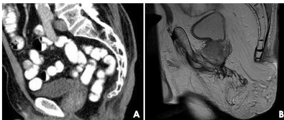
FIG. 3 Two male patients after abdominoperineal resection with primary perineal closure for rectal cancer. a Computed tomography image, sagittal plane, showing descent of a small bowel loop with

A possible explanation for not finding an impact of OP on abscess formation and perineal wound healing may be related to insufficient bulk of tissue because of low body mass index or inadequate mobilization. There is no consensus on the technical aspects of detachment of the omentum, whether to create a vascular pedicle on the right or left gastroepiploic artery, and the route along which the OP is positioned in the pelvic cavity (i.e. left paracolic gutter or via a mesenteric window). An insufficient OP leads to a small residual cavity, providing an opportunity for abscess formation. Another possibility is that the larger