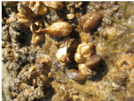
Figure 2. Mytilopsis leucophaeata in the Dniester liman (Photo: M. Son, 12 th August 2009).

Mytilopsis leucophaeata was found in 2001 in the Dniester Liman (Black Sea); however more intensive sampling in 2002 failed to find them again (Stepien et al. 2013; Grigorovich et al. 2002; I.A. Grigorovich, pers. comm.). Initial reports of M. leucophaeata in the Black Sea basin were documented by Grigorovich et al. (2002), who listed this species in an extensive literature review on alien species in the Ponto-Caspian region, and Therriault et al. (2004) identified M. leucophaeata among specimens collected from the region that were used to define dreissenid phylogeny (the year of collection was 2001; I.A. Grigorovich, pers. comm.). In August 2009, M. leucophaeata was recorded in the Dniester liman where populations were quite large (Table 1; Figures 2 and 3). Two live specimens in the Tuapse River bay of the Black Sea were collected in 2014. In the Dniester Liman, M. leucophaeata was found exclusively on hard substrates. In the Southern Bug River mouth area the species was sampled from concrete and granite