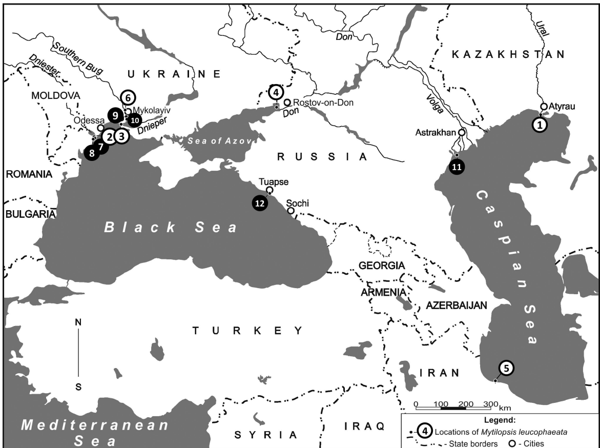
Figure 1. Map of the Ponto-Azov-Caspian region with sampling locations of M. leucophaeata (1–6: Earlier records in white circles with black line and numbers; 7–12: New records of this study in black circles with white numbers; 1: Republic of Kazakhstan, Caspian Sea, Atyrau (Guryev), near the Ural River mouth; 2: Ukraine, Dniester Liman, 2001; 3: Ukraine, Dnieper-Bug Liman; 4: Russian Federation, Taganrog Bay of the Azov Sea, close to the Don River delta; 5: Iran, Caspian Sea, Bandar Anzali; 6: Ukraine, Southern Bug River, near Mykolayiv (Nikolaev); 7: Ukraine, Dniester Liman, 2009–2014; 8: Artificial canals between Dniester and Budakskiy limans; 9: Ukraine, Southern Bug River mouth area; 10: Ukraine, Southern Bug Liman; 11: Russian Federation, north-western Caspian Sea, adjacent to the Damchik area of the Astrakhan Biosphere Reserve; 12: Russian Federation, Tuapse River bay of the Black Sea.

and adaptation to local conditions at new colonization sites (Zhulidov et al. 2015). The species is still expanding its distribution in Europe (Zhulidov et al. 2015; Forsström et al. 2016) and this recent spread is of concern because it can cause severe biofouling problems in brackish water systems (Mackie and Claudi 2010; Rajagopal and Van der Velde 2012). These problems include fouling of ship hulls, and clogging of cooling water systems and pump houses of power plants and industries (Van der Velde et al. 2010b).