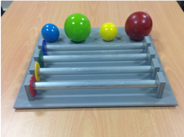
Fig. 1. The size–weight illusion apparatus. Two pairs of objects were presented to the participants one pair at a time. One pair consisted of a small yellow sphere and a large red sphere. Both weighed 120 g. The other pair consisted of a small blue sphere and a large green sphere. Both weighed 405 g. The participants held one object in one hand and the other object in a different hand. After weighing the objects, the participants then adjusted the corresponding slider to indicate how heavy each object was relative to the other, with the left side of the slider corresponding to light and the right side of the slider corresponding to heavy.

Seated opposite the participant at a table, the experimenter gave the following instructions: “I’m going to hand you these colored balls. I want you to tell me how heavy they are using the sliding rings in front of you. If this side [indicating the participant’s left] means light and this side [indicating the participant’s right] means heavy, slide the ring and leave it wherever you think it should go.”