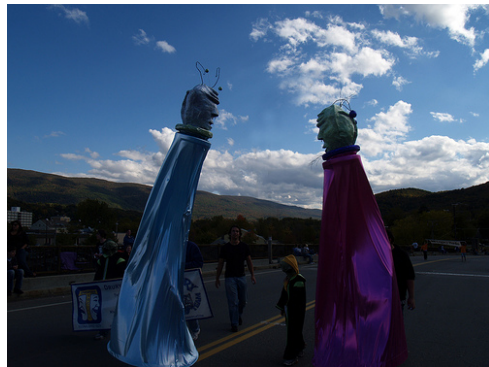
Figure 2: Example from the Flickr30k dataset

We see from the results that the text-only NMT model outperforms phrase based SMT model in terms of BLEU score. Our results indicate that incorporating image features in multimodal models helps, as compared to our text-only SMT and NMT baselines. This is reflected in the fact that both the image models are shown to produce better results in terms of BLEU scores with respect to both the SMT and NMT text-only counterpart.