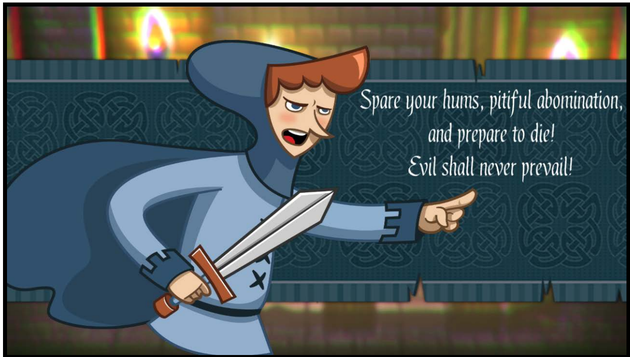
Figure 2: In NECESSARY EVIL , the hero is an outspoken and relentless non-player character whose objective is to vanquish evil; he will attack the monstrous player-character instantly and without apparent reasons.

In our self-reflexive videogame, the horned minion controlled by the players is confined in a dimly-lit room from which it cannot escape (see figure 1). The monster has, in fact, no constructive options for interacting with the room: the door does not open for its little red paws, the chest contains nothing, and the objects that are already in the room respond to the players' actions as if they were cheap theatrical props. These design decisions were meant to elicit a sense of marginality in the players, and to experientially reveal to them what a virtual world feels like when that world is designed around someone else's perceptions, needs, and narrative progress. In other words, the players' possibility for interaction with the world of NECESSARY EVIL , as well as the duration and the quality of their experience, are deliberately designed to be deficient and unsatisfactory (Gualeni, 2015b).