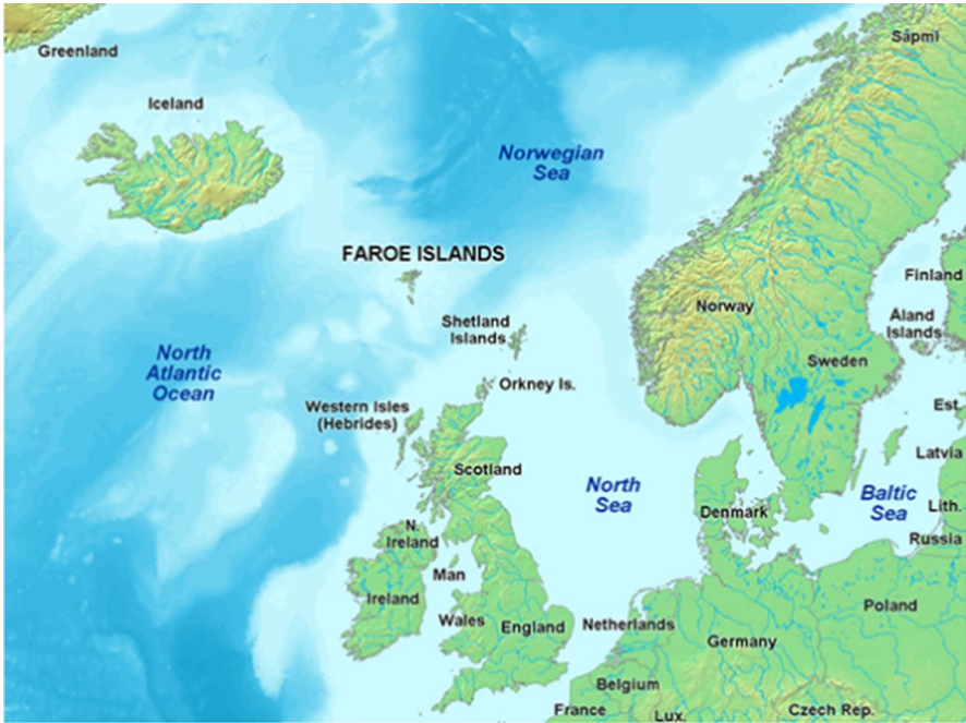
Figure 1 The geographical location of the Faroe Islands