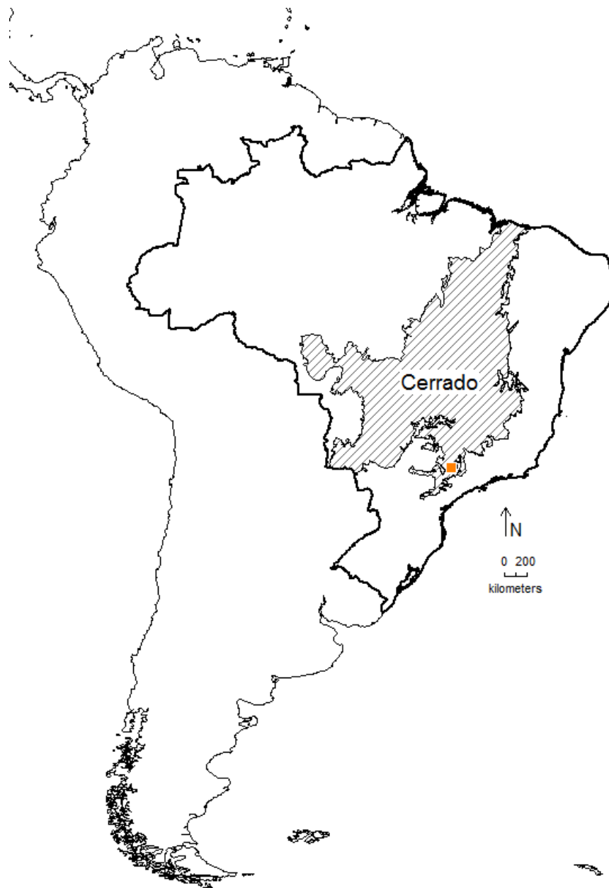
Figure S1. Cerrado biodiversity hotspot distribution in Brazil (thicker line), the second largest vegetation formation in South America, and the study area location: Itirapina Ecological Station. Map elaborated using DIVA-GIS version 7.5 [1]; Biomes of Brazil shapefile obtained from [2].