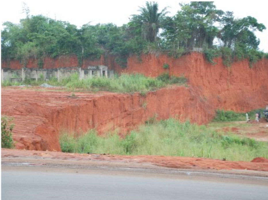
Plate 3: Excavation at a closed proximity to the major Ota-Idiroko international highway