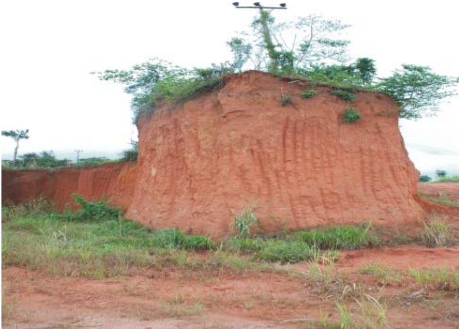
Plate 2: Excavation that endangered Electric Pole