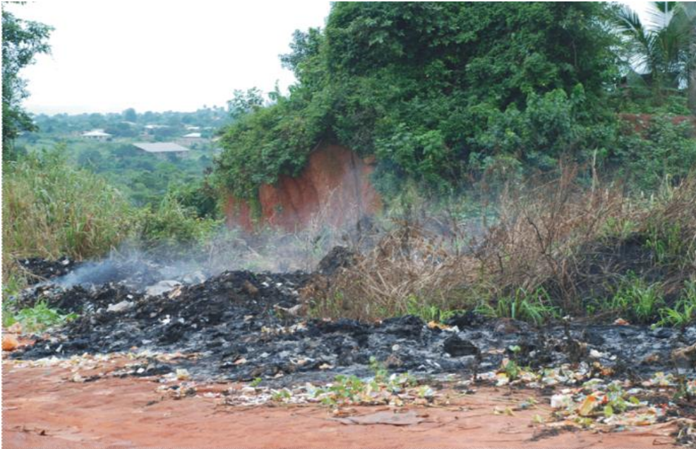
Plate 4: Excavated Site Converted to Refuse Dumping Ground