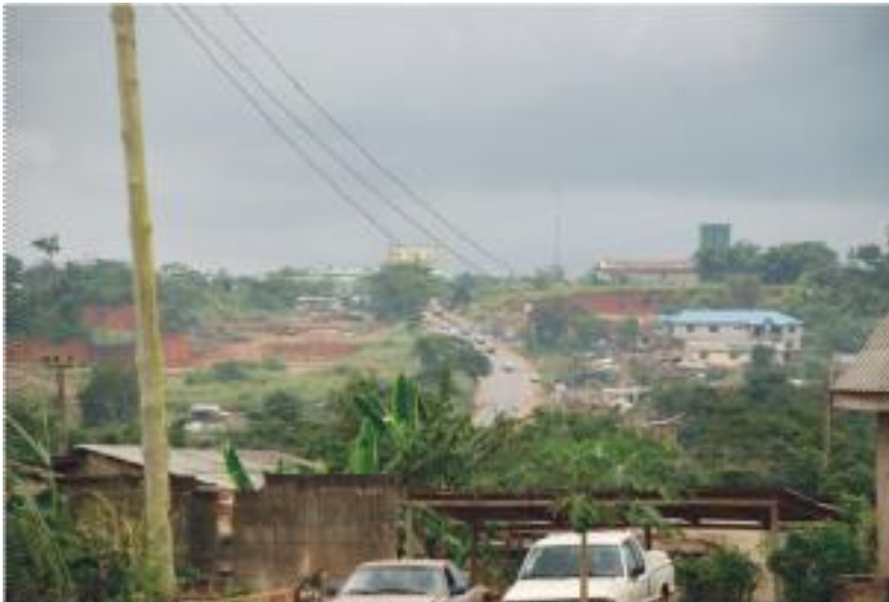
Plate 1: A Series of Excavated Sites that Endanger the Major Ota-Ikoro international highway.

this presents a picture of rough impact of digging and confirms the extent of the environmental degradation caused by sand-digging. The common impact includes a series of environmental problems: soil erosion, loss of cropland, deforestation, ecosystem destruction, and extinction of species and varieties.