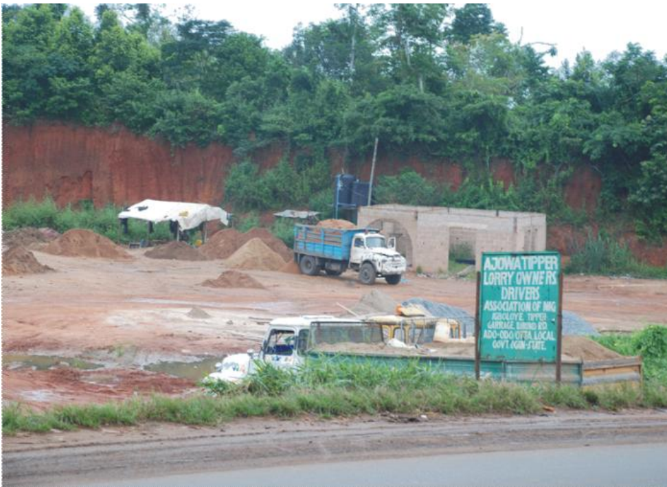
Plate 5: Depth of Excavation that Subsumes Vehicles very near the major Ota-Ildiroko international highway.