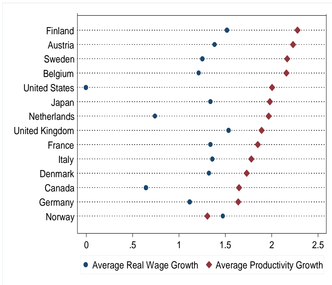
Figure 2. Average per Annum Growth in Real Wages and Productivity in the Manufacturing Sector: 14 Advanced Capitalist Countries, 1970 to 2007

Note: Countries arrayed from highest to lowest based on average productivity growth between 1970 and 2007.