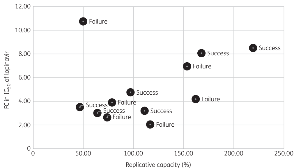
Figure 2. Scatter plot of FC in IC_{50} of lopinavir relative to a subtype B reference strain, versus replicative capacity as measured over a single round of replication (also relative to a subtype B reference strain, which is represented by 100%).

increased replicative capacity and resistance to PI might involve an overlapping mechanism.