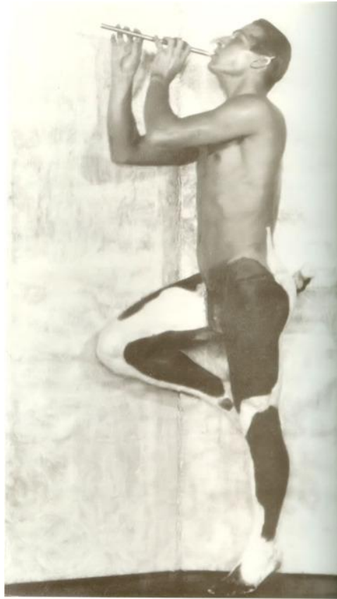
Fig. 2.2: Valentino