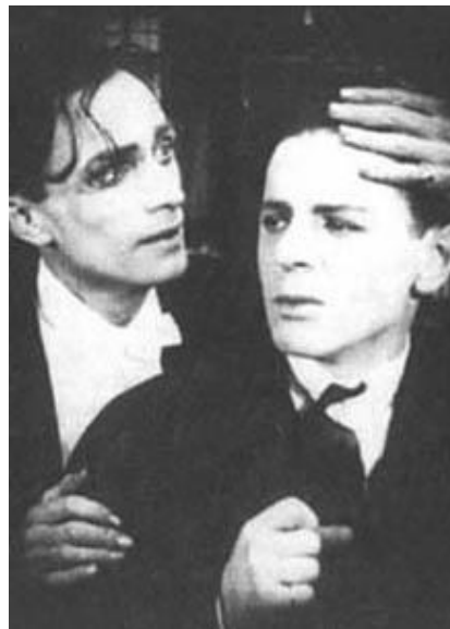
Fig. 1.4: Veidt (left) as he looks in Anders als die Andern .