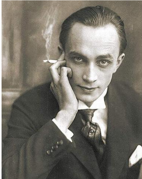
Fig. 1.3: Publicity photograph of Conrad Veidt c.1919.