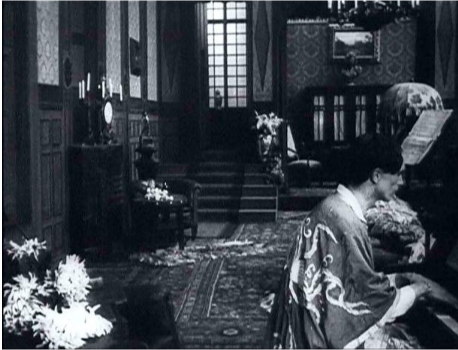
Fig. 1.1: Conrad Veidt as Paul in Anders als die Andern