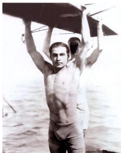
Fig. 2.1: Rudolph Valentino publicity shot