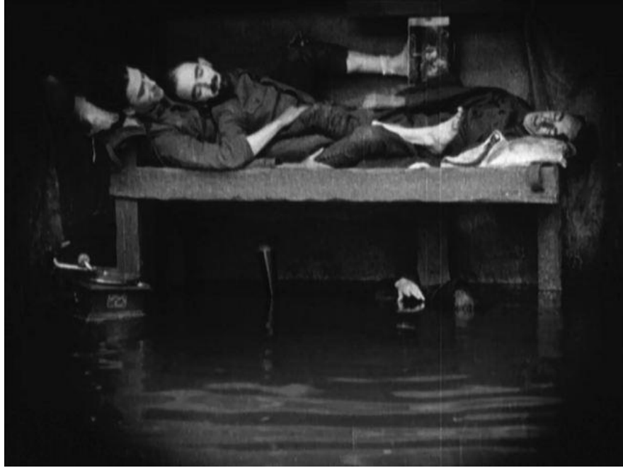
Fig 4.2: Depiction of the trenches in Shoulder Arms

In The Lost Battalion the feeling of camaraderie evaporates as the elongated battle sequence takes over. There are no breaks in the action for the audience to find out how the various individuals we have been introduced to are coping, although we do occasionally get to see one injured or killed. It is only at the very end of the film that we catch up with the various individual characters again in an overlong sequence in which they return home and/or are presented with medals for bravery.