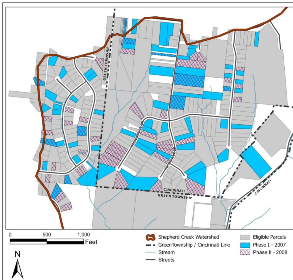
Figure 2. Spatial analysis of Phase I (2007) and Phase II (2008) successful bids. Note higher density of clusters among properties along Horizonvue Drive and the Westonridge Drive cul-de-sac (in center of figure). The dashed line marking the boundary between Cincinnati and Green Township roughly follows Latitude 39.182 N.

to bid. We then generated 10,000 sets of randomly selected groups of properties, computed the average pairwise distance for each, and ranked the average pairwise distance for those parcels that had successfully bid, comparing these to generate a probability-of-occurrence ( P ) value. Thus, a very small P -value indicates that the observed average distance between properties is very unlikely to be due to random chance and therefore is an indication that there is non-random structure present in the locations of the successful bids, i.e. , spatial correlation due to the influence of social capital. All calculations were made with the Statistical Analysis System (ver. 9.2; SAS Institute; Cary, NC, USA).