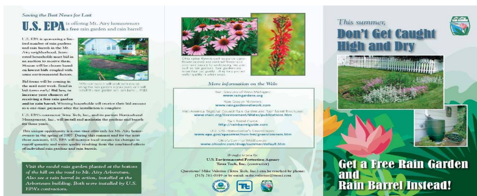
Figure 1. Educational brochure distributed to all eligible property owners.

The education campaign consisted of direct mailings to residents and two demonstration rain gardens and one rain barrel at a local public arboretum with signage. The campaign aimed to educate residents on stormwater issues and to promote the opportunity to participate in our project. The first mailing notified landowners of the opportunity to participate via cover letter and brochure (Figure 1). Two weeks later, a second mailing including a cover letter, brochure, and auction bid form was delivered along with a self-addressed, stamped envelope. In addition, all recipients received nominal compensation ($ 5 USD) for their time and to encourage bidding. In the first round of bidding in 2007, door hangers were distributed as reminders. The bidding process was extended by 2–3 weeks, and an additional letter and bid form were sent during this time.