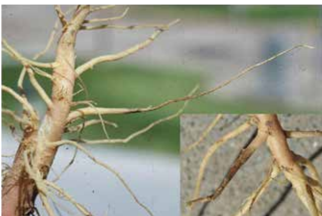
Figure 8. Tip rot of feeder roots in pigweed due to Pythium spp.