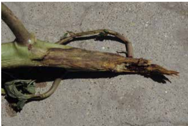
Figure 7. Severe rot of pigweed taproot due to Pythium spp.