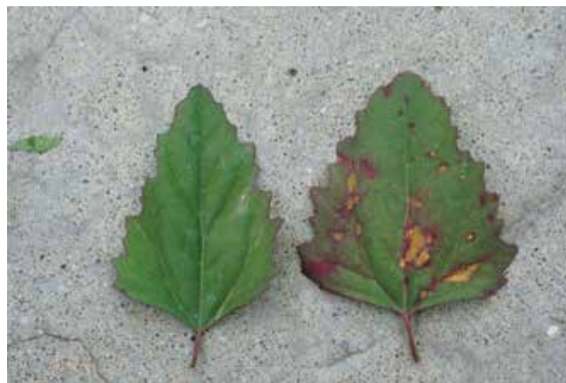
Figure 9. Cercospora leaf spot symptoms on lambsquarters (right) compared to healthy leaf on left.