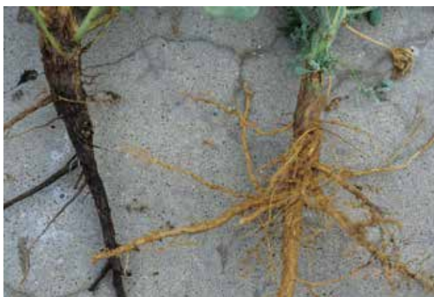
Figure 5. Severe root rot (left) due to R. solani in Kochia (fireweed) roots compared to unaffected plant on right.