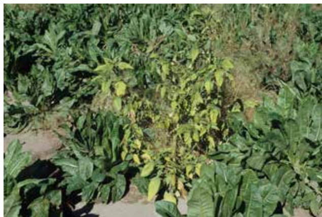
Figure 3. Yellowing and wilting symptoms in pigweed.

Based on the severity of observed plant symptoms, some of the diseases on weeds, such as those caused by nematodes on lambsquarters or Pythium infections of pigweed roots, did not appear to severely damage weeds. However, it does illustrate the problem of potential pathogen carryover, and inoculum increase in fields in the absence of sugar beets or dry beans. It has long been observed that beans following beets in rotation often yield poorly. The reasons for this are not completely understood, but may be partially due to the fact that R. solani and Pythium spp. can cause disease in both crops.