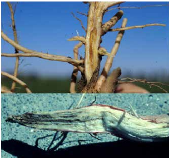
Figure 6. Vascular discoloration of stems (top) and root (bottom) due to F. oxysporum in pigweed.