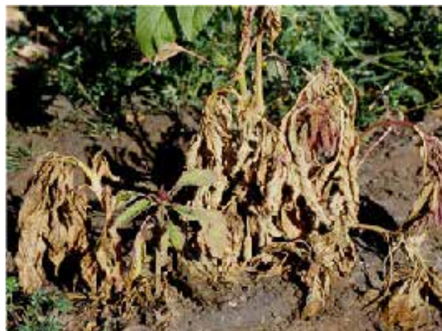
Figure 2. Wilting symptoms in pigweed.