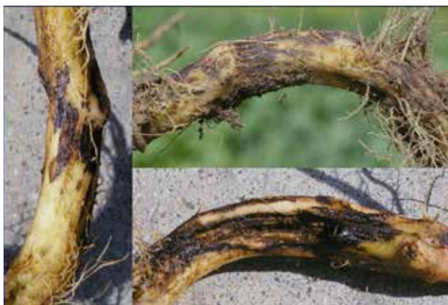
Figure 4. Individual necrotic lesions (left) from R. solani coalescing to form larger rotted areas in pigweed roots (right — top and bottom).