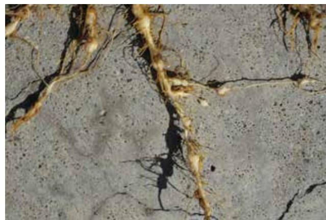
Figure 10. Galls on lambsquarters roots caused by the false root-knot nematode ( N. aberrans ).

the cropping cycle with nonhosts, the buildup of the pathogens causing disease should theoretically be reduced in these cases. Other pathogens such as Rhizoctonia and Pythium are less specific and more versatile in the plants they are capable of attacking; therefore, rotation would likely have little effect on reducing the severity of these diseases. However, in either case, the presence of infected weeds in fields could easily nullify the desired benefits of rotation for disease reduction by harboring or increasing certain pathogens that could subsequently attack new sugar beet and/or dry bean crops.