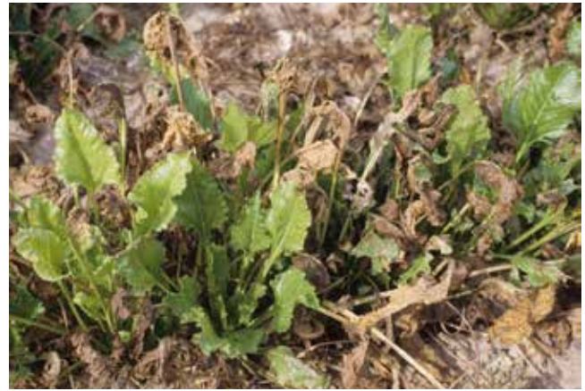
Figure 7. Severe infection with multiple leaves completely dead and covered with masses of coalesced lesions. New growth emerging is unaffected.