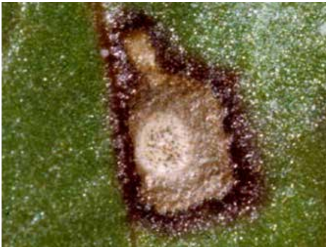
Figure 4. Macroscopic view of pseudostromata within lesion centers.

moisture is on leaf surfaces, then infection cannot occur.