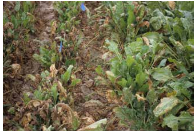
Figure 9. Benefits of genetic resistance to the pathogen after a severe CLS epidemic. Plants at left are susceptible and those at right are tolerant.

1 was three while on Day 2 it was four. The sum of these two days was seven, resulting in conditions that would favor infection. If no symptoms were observed on leaves, then the DIV sum indicates that careful scouting is advised; if symptoms were present, a fungicide application would be warranted. If on Day 3, there were 12 hours of leaf wetness and the temperature during this period was 62°F, then the DIV sum for Days 2 and 3 is 4+0=4 , and no action would be necessary.