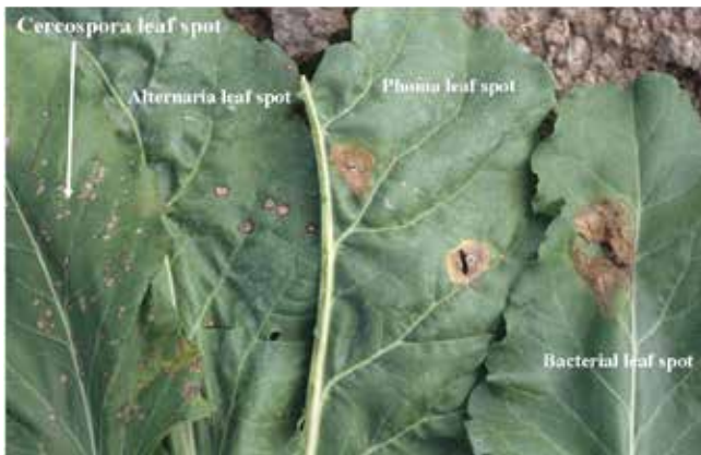
Figure 2. Comparison of symptoms among several common foliar diseases of sugar beets. From left to right: Cercospora, Alternaria, Phoma and bacterial leaf spots.