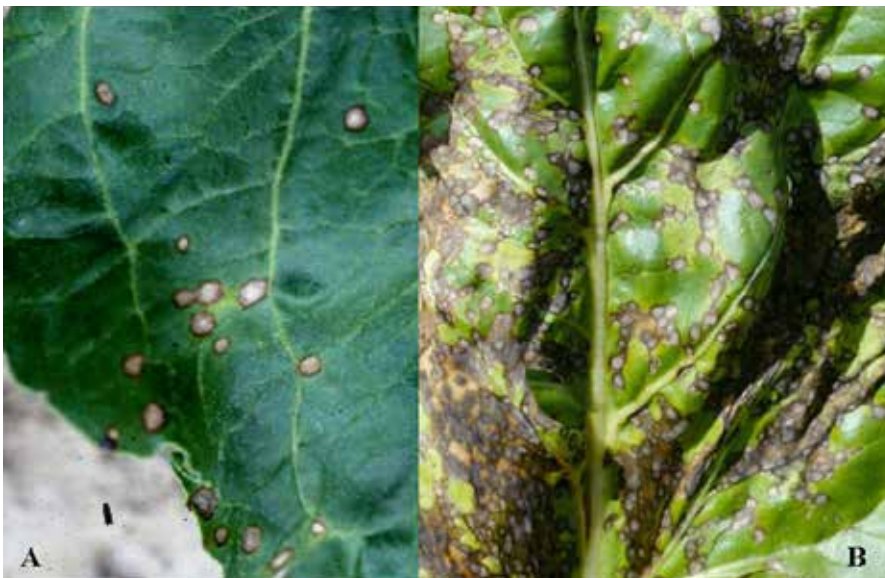
Figure 1A-B. Individual ash-colored circular lesions with dark brown borders (A). Advance infection with coalescing of individual lesions (B).

The development of disease is highly dependent upon the presence of susceptible cultivars, adequate inoculum and environmental conditions characterized by periods of high humidity or leaf wetness periods longer than 11 hours and warm temperatures (>60°F). Since leaf wetness is not routinely measured, relative humidity above 90 percent humidity can be used as a substitute. All of these factors must be present simultaneously for disease to begin and progress. For example, if a susceptible cultivar and adequate inoculum are present, but temperatures are too cold or warm or no