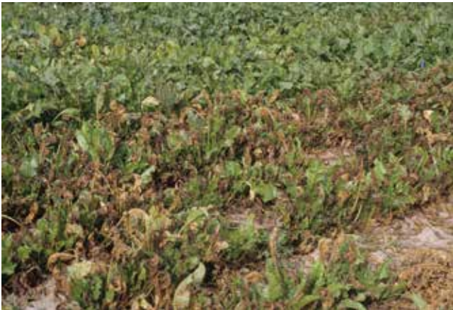
Figure 8. Severe infection from a distance, giving plants the appearance of being burned.