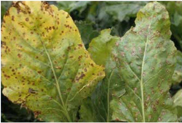
Figure 6. Cercospora -infected leaves. Leaf at left is beginning to yellow and die.