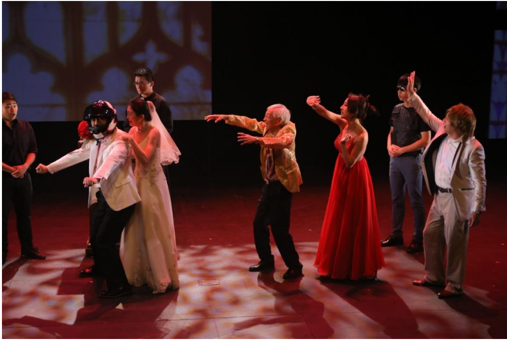
Figure 18: Man Zyu’s family eagerly bids her farewell after her wedding