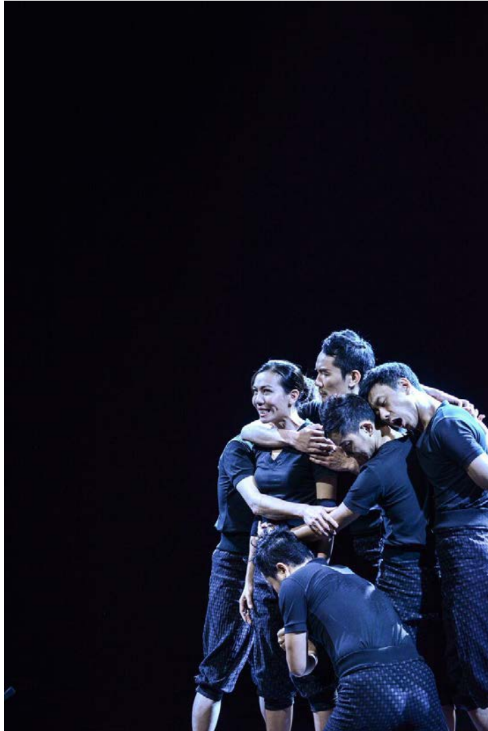
Figure 7: Physical energy of the actors, photograph © Fung Wai-sun, Tang Shu-Wing Theatre Studio.

Kong audience had grown accustomed to watching realist plays, but now they have begun to accept different forms of expression in theatre. It is also hoped that non-language theatre and realist theatre can develop simultaneously, so as to enrich the cultural realm of Hong Kong” (Tang, “Reconstructing” 134; my trans. ).