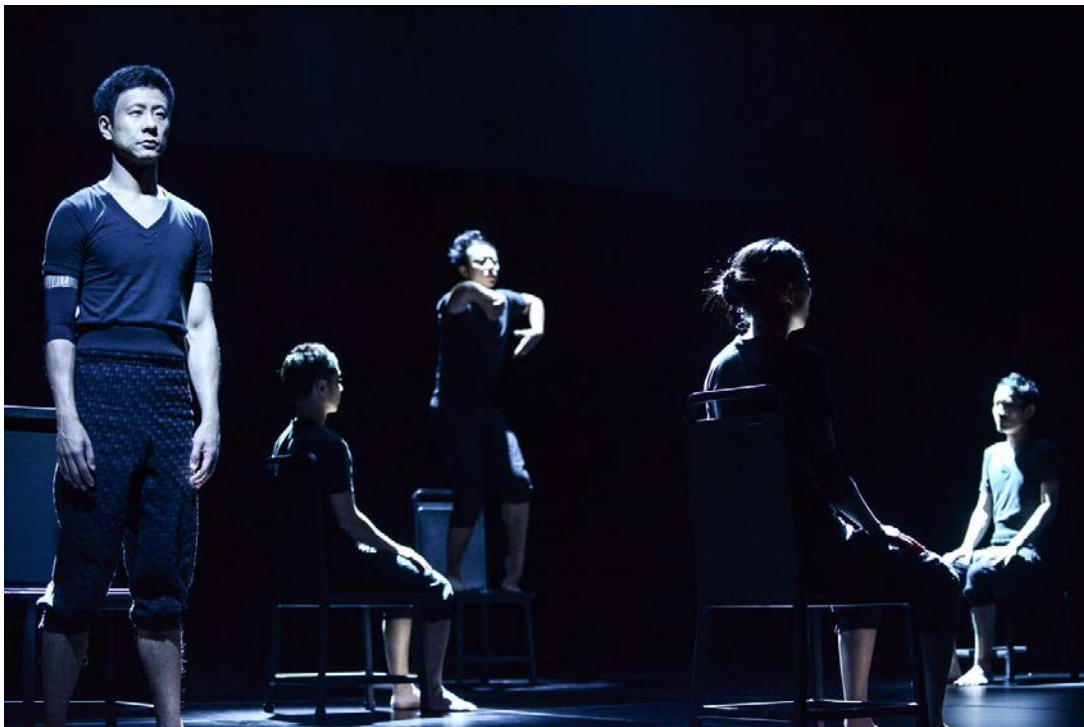
Figure 8: Using minimalism to express strong emotions, photograph © Fung Wai-sun, Tang Shu-Wing Theatre Studio.

Apart from training his actors in breathing techniques, Tang also employs the actors' bodies to depict strong emotions of the characters. He is a follower of Jerzy Grotowski's concept of the "poor theatre", in which the actors' bodies are the most important source of energy on stage (Tang, "Why" 208; my trans. ). To enable the actors to express their energy unimpeded, Tang advocates a minimal stage design (Tang, "Why" 208; my trans. ). Thus the stage of Titus Andronicus 2.0 is bare except for some chairs, and the actors dress simply in black outfits like the backstage crew, as exemplified in Figure 8 below. At the end of act 3, scene 1, when Titus is deceived by Aaron and has his right hand chopped off, and the skulls of his sons Quintus and Martius are returned to him, all seven actors fall down one by one onto the floor (Chong, "Titus" 17), which represents the immense grief felt by Titus and his family members.