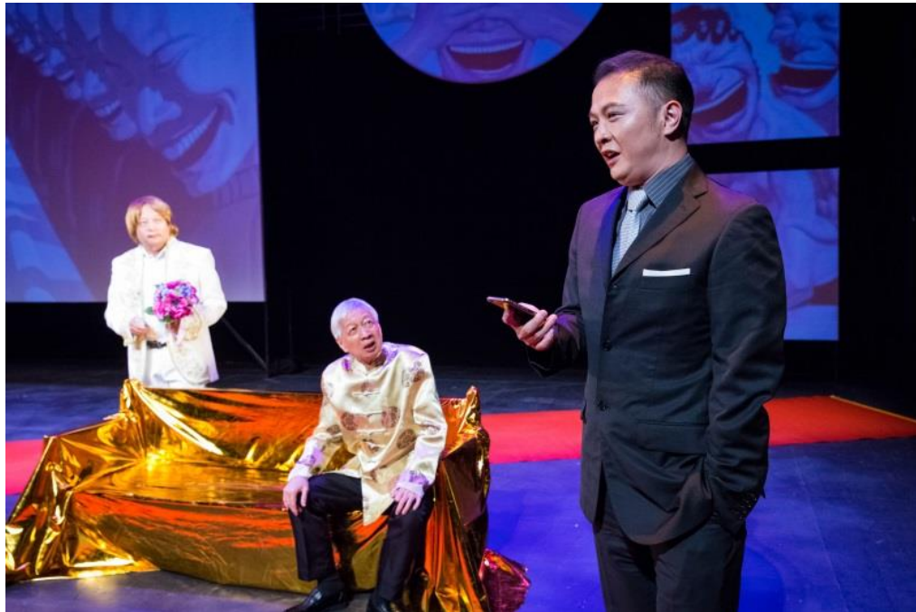
Figure 25: The inclusion of cell phones as tools of communication, photograph © Big Stage Theatre.

includes the director's new concept of marriage, and the inclusion of modern technology also serves as a satiric depiction of consumerism. This reminds us of Sanders' assertion that Shakespeare has been a "particular focus, a beneficiary even, of these ... updatings" (19), as the appropriations of Shakespeare make him fit for new cultural contexts (46).