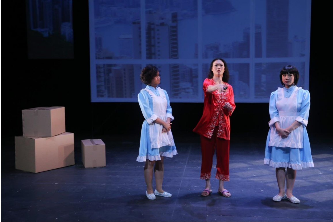
Figure 28: A satirical scene of the free-to-air television license dispute in Hong Kong in 2013, photograph © Big Stage Theatre.

The above dialogue between Man Zyu and the maids refers to a dispute over free-to-air television licenses in 2013. In 2009, the Hong Kong government announced that more free-to-air television licenses would be granted to end the long-time hegemony of Television Broadcast Limited (TVB). Nevertheless, in 2013, the government rejected the license application of a popular network, HKTV, and it also refused to give any explanation to the public (Engel, “How”). It was widely suspected that the denial was because HKTV’s chairman, Ricky Wong Wai-kay (王維基) had pro-democracy affiliations, as he had enlisted support from Chan Kin-man (陳健民), one of the three advocates of the Umbrella Movement, to serve on HKTV’s Board of Directors (AM730, “Wong”; my trans. ). As asserted by Cloud Yip, a Hong Kong reporter, the HKTV