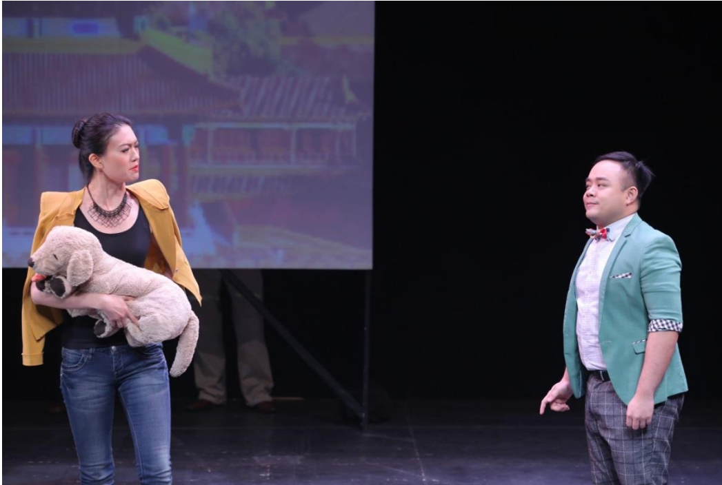
Figure 19: Man Zyu saves the puppy from being eaten