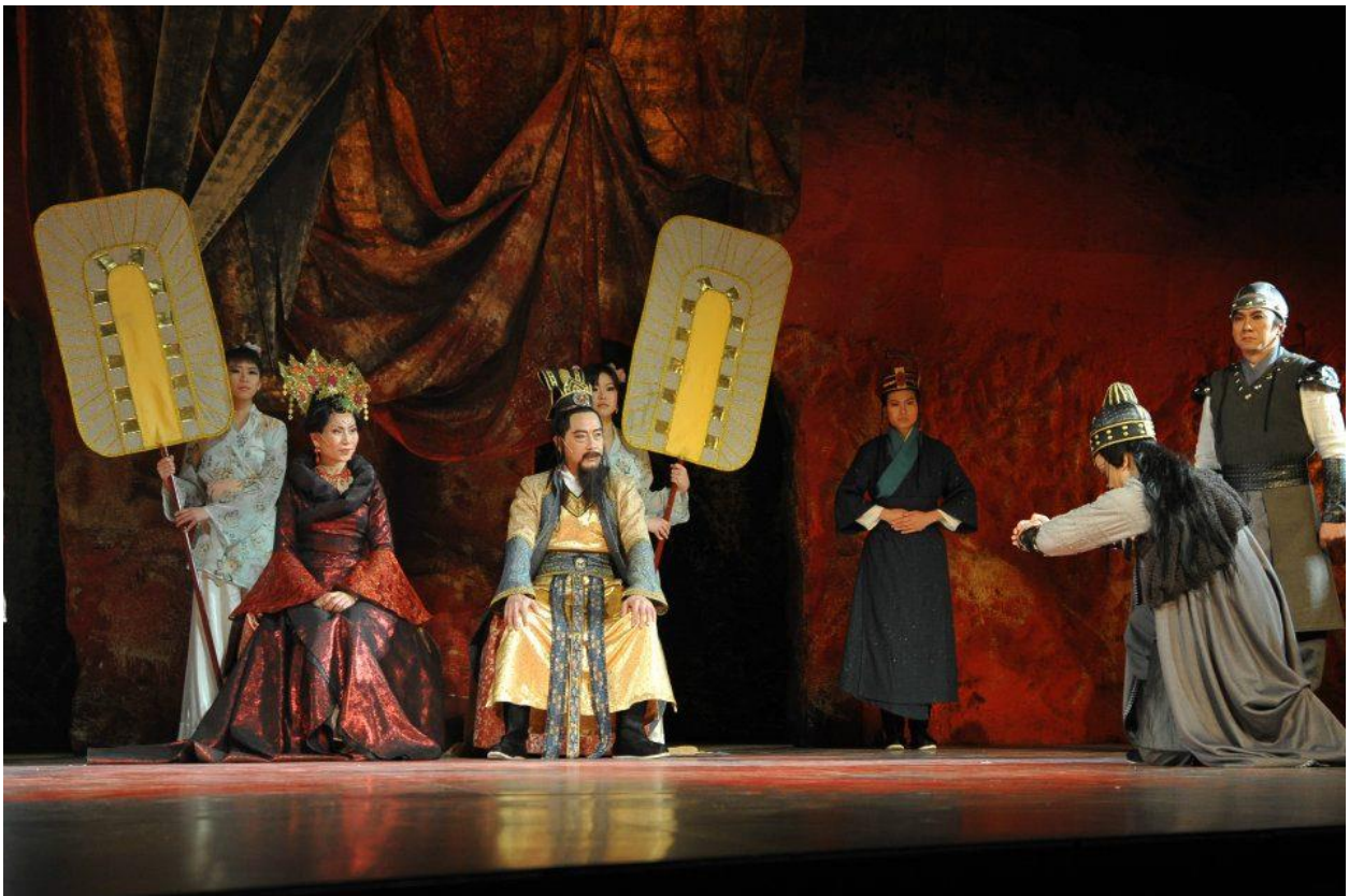
Figure 1: Sinicized setting of Hamlet: Sword of Vengeance