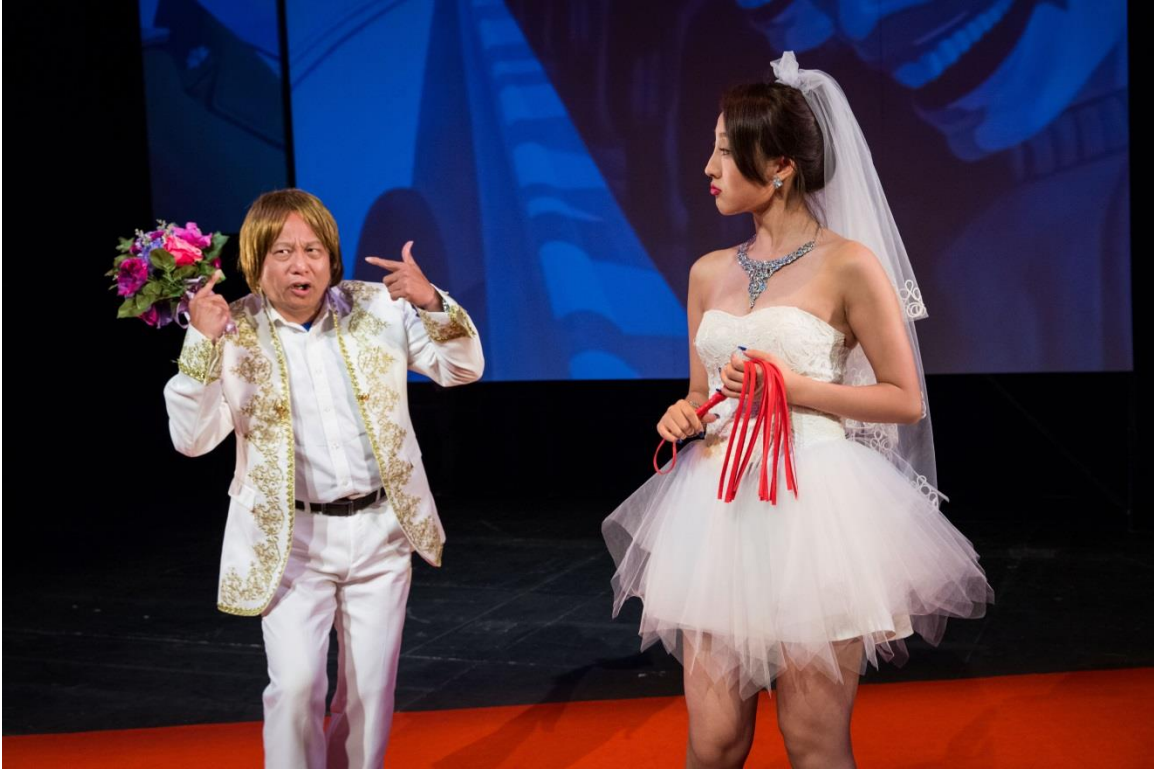
Figure 22: The superficiality and fakeness of Gam Zyu and Wang Song.

In Post-The Taming of the Shrew , Peter leads the audience to see through Gam Zyu's fakeness and materialism. He tells his wife,