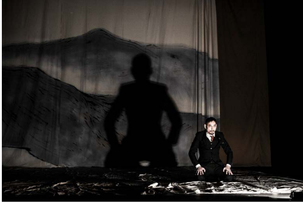
Figure 10: Macbeth transitions from modern Hong Kong to ancient China