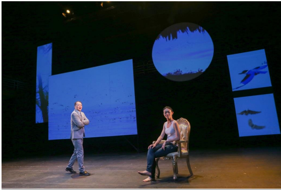
Figure 24: Another added conversation between Peter and Man Zyu on photographs