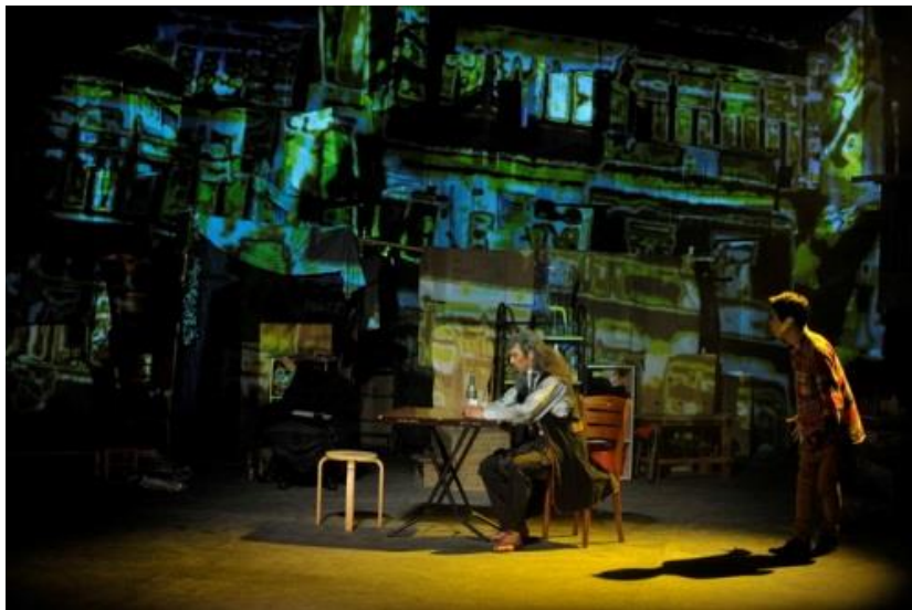
Figure 17: Uncle Lee’s estranged relationship with his son