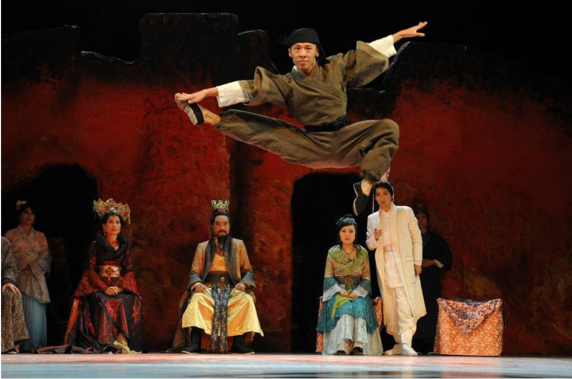
Figure 2: Display of acrobatics in the ‘Mousetrap’ scene, photograph © Tam Kam-chi, Arts Centre of Dance & Martial Arts.

I propose that the setting of the Five Dynasties and Ten Kingdoms period in Hamlet: Sword of Vengeance gestures towards an apolitical China, exotically distant from the political or communist China that Hong Kong people are much afraid of (S. Chan, “Equivocating” 423; my trans. ). The cultural China in Hamlet: Sword of Vengeance manifests on four levels: the transposition of geographical locations, the depiction of time, the employment of Chinese historical or literary figures, and the insertion of classical Chinese poetry. First, Western geographical locations in the source text are transposed to places on the ancient Chinese map. For example, Liu Huan (劉桓) (Hamlet) is sent by his uncle, Liu Hong-xi (劉弘希) (Claudius) to the Tang Kingdom (唐國) instead of England in Hamlet . There are also some instances in the lines of Hamlet :