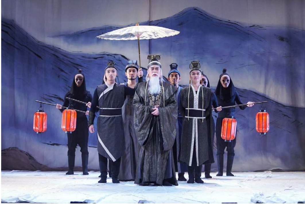
Figure 11: Duncan and his followers against the backdrop of a highland, photograph © Fung Wai-sun, Tang Shu-Wing Theatre Studio.

Just like Macduff's eventual usurpation of the despotic ruler, Macbeth, Tang's Macbeth subtly represents Hong Kong people's subconscious desire to usurp its chief executive. Upon hearing Malcolm's "confession" of being a "new tyrant", Macduff cries in despair, "Scotland! Scotland" (Chan and Tang 43; my trans. ). This is allegorical of Hong Kong people's desperate cries for the future of the city. When Malcolm asks Macduff if someone like him is fit to govern, Macduff exclaims, "Fit to govern? No, not to live" (Chan and Tang 43; my trans. ). This is a particular moment in the adaptation when almost all the reviewers who attended Macbeth's première in Hong Kong laughed (L.C.M. Lau 15; my trans. ). 94 But they did not laugh out of pure joy, but out of bitterness