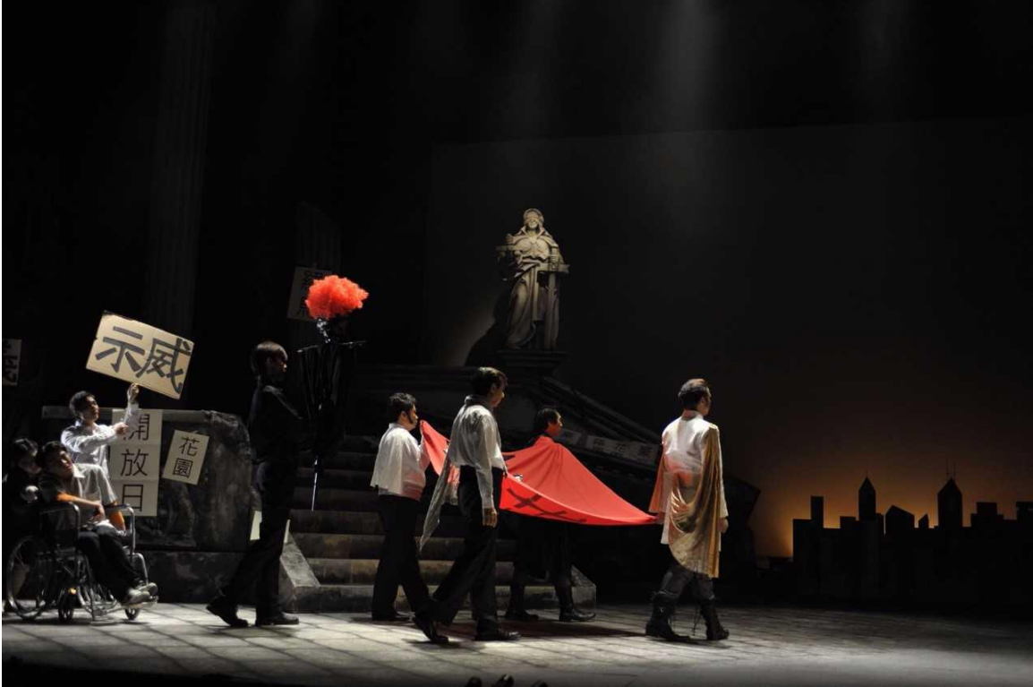
Figure 13: A muted protest under the Statue of Justice

On the one hand, Shakespeare's Julius Caesar primarily centres on the lives of the ruling class and their struggle for power, while the commoners in Rome only constitute minor roles in the play. Calphurnia, wife of Caesar, exclaims, "When beggars die there are no comets seen; / The heavens themselves blaze forth the death of / princes" ( JC 2.2.30-32). 105 Calphurnia's remark reinforces the idea that the poor and the powerless are of no significance at all, whether living or dead. Contrastingly, Tsoi's Julius Caesar elevates the role of the commoners to the "fifth main character" ("Julius Caesar