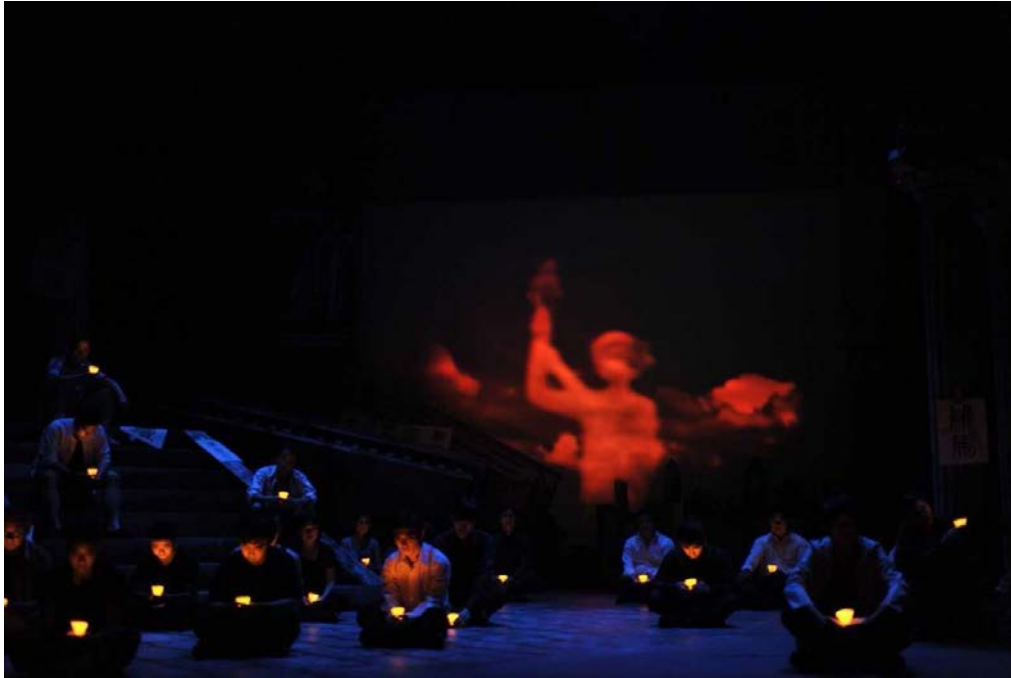
Figure 14: A muted commemoration of the June Fourth Massacre, photograph © Priman Lee, Hong Kong Theatre Works.