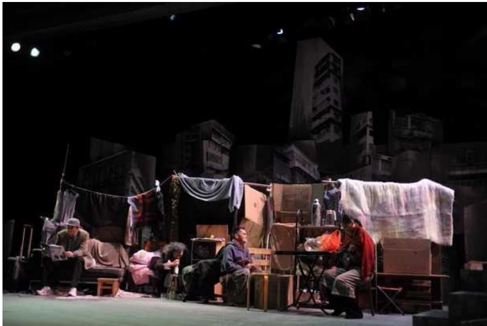
Figure 15: Homeless people in Hong Kong as the main characters in Shamshuipo Lear