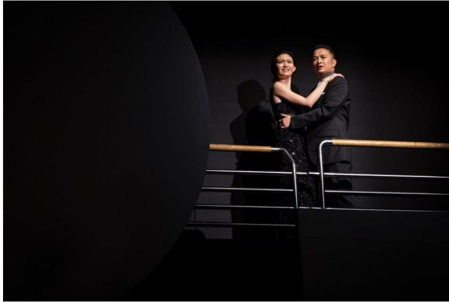
Figure 26: The play ends with an offstage conversation between Peter and Man Zyu, photograph © Big Stage Theatre.

The added private conversation between Peter and Man Zyu in Post-The Taming of the Shrew extends what many perceive as the fakeness of Katherina's submission speech in the source text, and it further alludes to the double impossibility of taming in both gender and political terms. Peter, who represents the mentality of Hong Kong people, knows all too well that China will continue to restrict the freedoms of Hong Kong people, and Hong Kongers can do little to forestall this from happening. Not long after the play's premiere, for instance, Anson Chan, former Chief Secretary of Hong Kong, organized a seminar titled "2047: Where are you going, Hong Kong?" in June 2017. The idea behind this seminar was that over the course of only 20 years since the handover in 1997, the practice of "one country, two systems" in Hong Kong had already fallen short of many people's expectations (Project Citizens Foundation, "Project"). 2047 marks the year when the 50 years of unchanged way of life promised under the Basic Law expires in Hong Kong. Sensing that the scopes for freedoms and pursuit