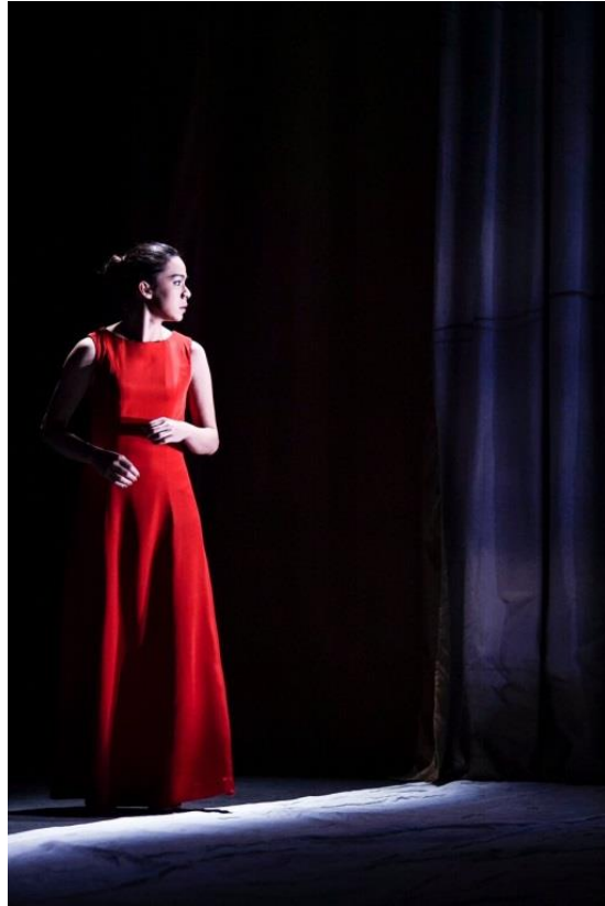
Figure 9: Symbolism of Lady Macbeth's red dress