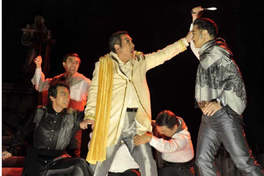
Figure 12: Assassination of Caesar