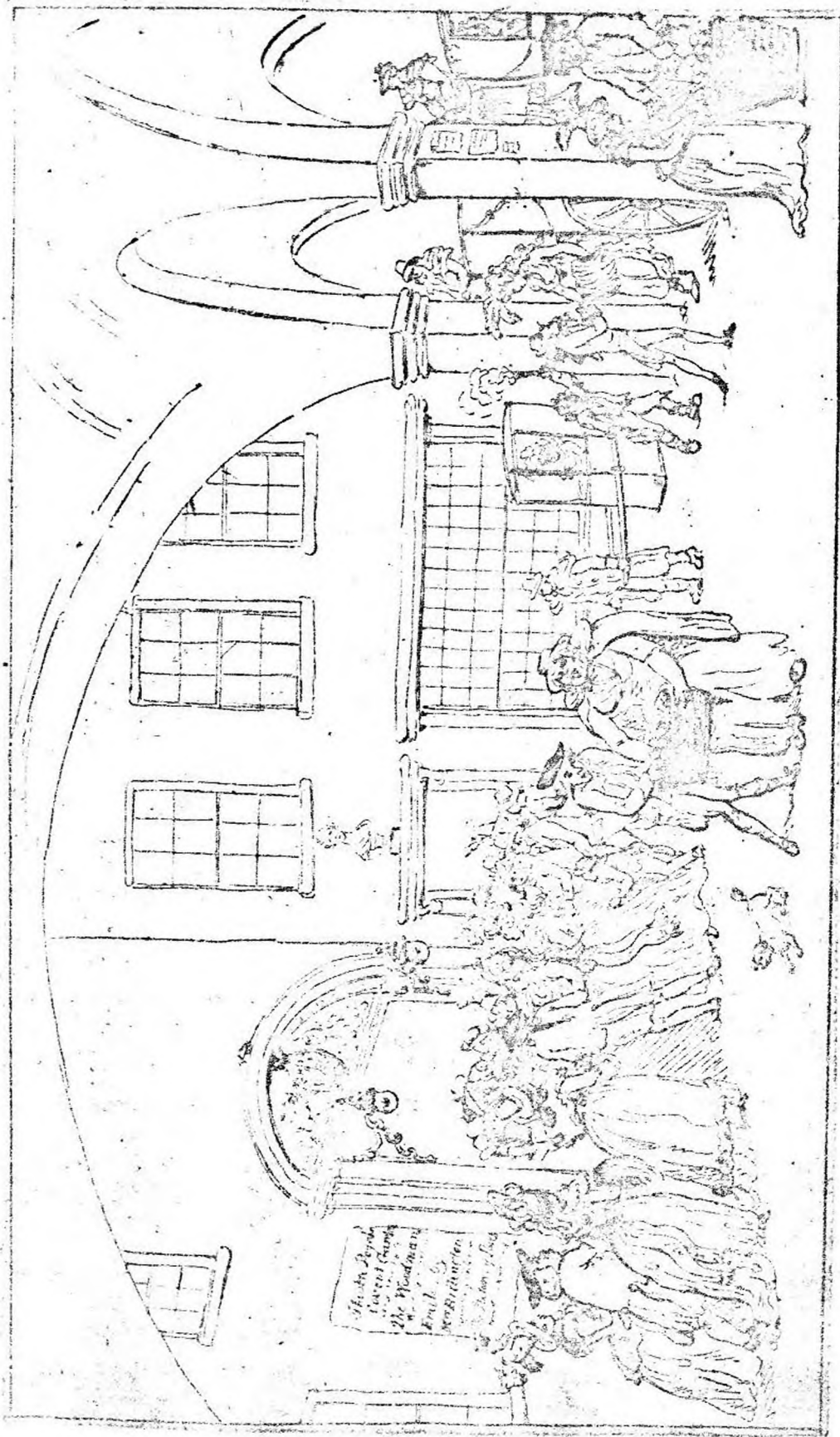
THE ENTRANCE TO OLD COVENT GARDEN THEATRE. MAKE.

Rare print of the theatre as it was in Goldsmith's time showing the audience waiting under the arches. Print reproduced by kind permission of the Archivist, Royal Opera House, Covent Garden.