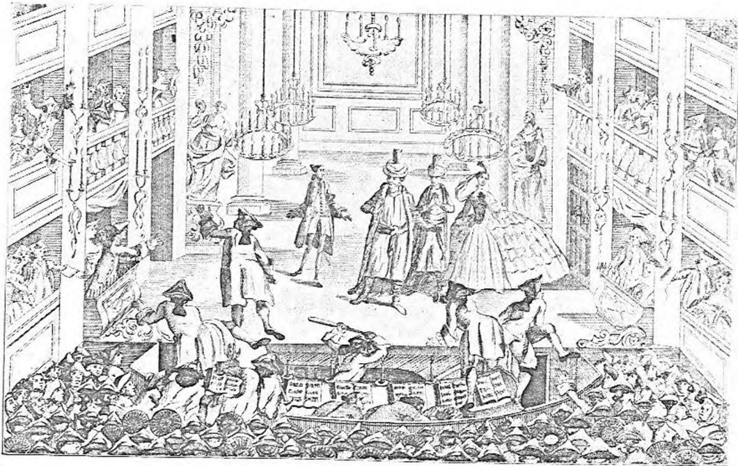
RIOT AT COVENT GARDEN THEATRE DURING THE PLAYING OF "ARTAXERXES," 1763.

From The Annals of Covent Garden Theatre by Henry Saxe Wyndham