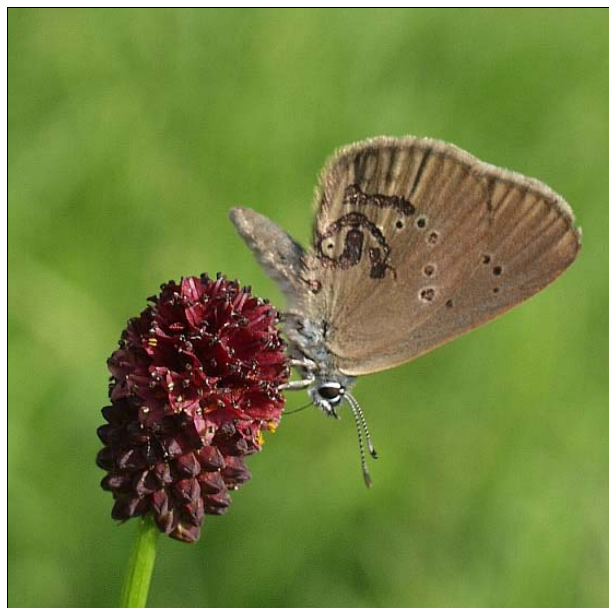
Fig. 1: A marked female of M. nausithous on a Sanguisorba officinalis flowerhead at Hidegség.

Myrmica scabrinodis has also been recorded as a host of M. nausithous in Spain (see MUNGUIRA & MARTIN 1999). Hosts of M. nausithous other than M. rubra and