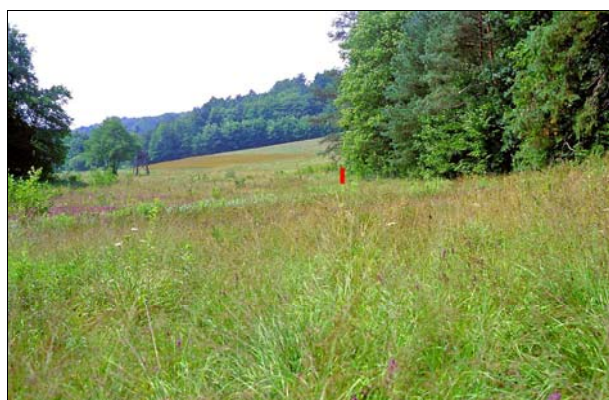
Fig. 2: The site of Maculinea nausithous at Kétvölgy. Red lines sign the narrow zone where the nests of M. rubra occurred.

M. scabrinodis have not been recorded anywhere (see ALS & al. 2004: supplementary tab. 10). During our work none of the 47 M. scabrinodis colonies that were searched contained larvae of M. nausithous in contrast to the host nests of M. rubra (Tab. 1). The number of Myrmica gallienii BONDROIT, 1920, M. ruginodis NYLANDER, 1846 and M. specioides BONDROIT, 1918 nests that were examined was too small to establish their suitability for being a host of M. nausithous in Hungary. However, we suppose that they cannot serve as important M. nausithous hosts in the study sites since their nests were found only in small numbers there. Moreover, several other Myrmica species were also formerly recorded from both of the regions investigated – from the Órség region: M. sabuleti MEINERT, 1861, M. salina RUZSKY, 1905, and M. schencki VIERECK, 1903; from the Fertő region: M. microrubra SEIFERT, 1993, M. gallienii , M. sabuleti , M. salina , M. schencki , M. scabrinodis ,