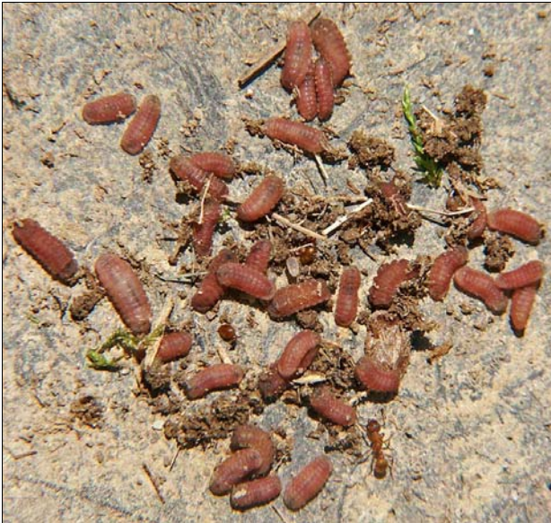
Fig. 5: These 28 Maculinea nausithous and eight M. teleius caterpillars were found together in one Myrmica rubra nest (see Tab. 1). There is also a M. rubra worker on this photo to enable estimation of the size of the caterpillars.

ied some M. nausithous specimens from Slovakia and Poland but they did not examine any from Hungary. Accordingly, it would be worth studying the host-ant specificity of M. nausithous in Slovakia and comparing M. nausithous specimens from Hungary genetically with Slovakian and Polish ones. It would be desirable to do similar experiments on the European southern fringe populations of M. nausithous in Slovenia (see WYNHOFF 1998), Bulgaria (KOLEV 2002) and especially the isolated and acutely endangered populations in Transylvania (Romania; BÁLINT 1996, RÁKOSY & LÁSZLÓFFY 1997, T. Cs. Vizauer pers. comm., A. Tartally, pers. observ.).