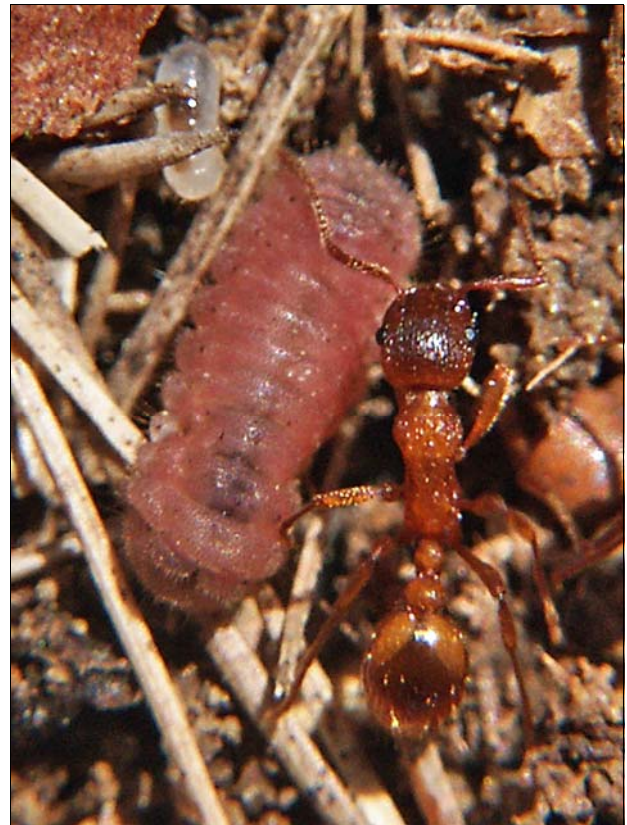
Fig. 4: An overwintered Maculinea nausithous caterpillar in a Myrmica rubra nest at Gödörháza (photo by P. Kozma at the investigation).

These results are also of interest from a phylogenetic point of view because ALS & al. (2004) have observed two genetic forms in M. nausithous : they found that a specimen from Slovakia strongly diverged from the Polish and the Central-Russian specimens (see ALS & al. 2004: Fig. 2 and Supplementary Tab. 1). Potentially, these different forms of M. nausithous could use different host-ant species as has been found in M. alcon and M. rebeli (e.g.,