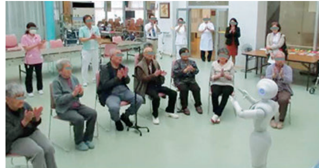
Figure 2. Positional relation among Pepper-CPGE, older adults and healthcare providers