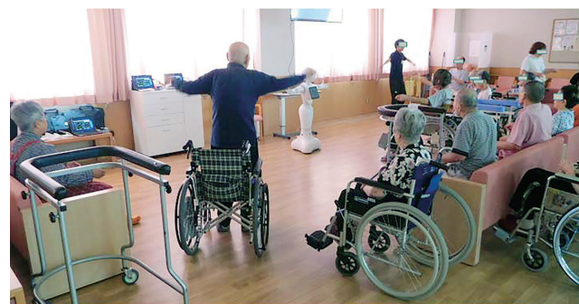
Figure 4. Increased motivation of the older adults for gymnastics evoked by Pepper-CPGE

Figure 4 shows the increased motivation of the older adults for gymnastics evoked by Pepper-CPGE. In this case, the older adults who is using the wheelchair for usual transfer, standing up with Pepper-CPGE's leads and performs gymnastics.