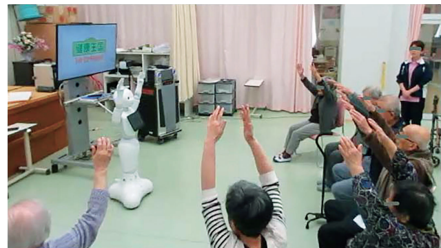
Figure 3. Pepper-CPGE that encourages older adults to maintain their physical functions

Figure 3 is a scene where Pepper-CPGE conducted a range of motion (ROM) exercise for older adults by demonstrating upper limb lifting while explaining the method of gymnastics exercise. In this activity Pepper-CPGE can lead the older adults to do active ROM exercises.