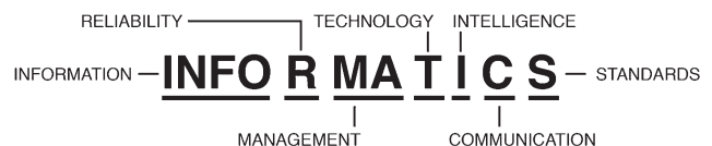
Figure 1. Concepts in Informatics

The purpose of the article is to illuminate the influences of the