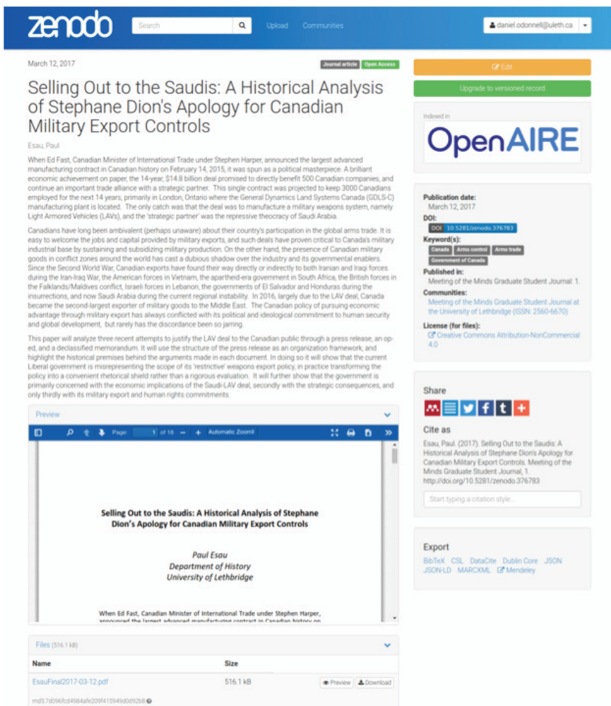
Figure 3: Screenshot showing entry for a typical article in the Meeting of the Minds Journal 3

– is directly available via a permanent URL.