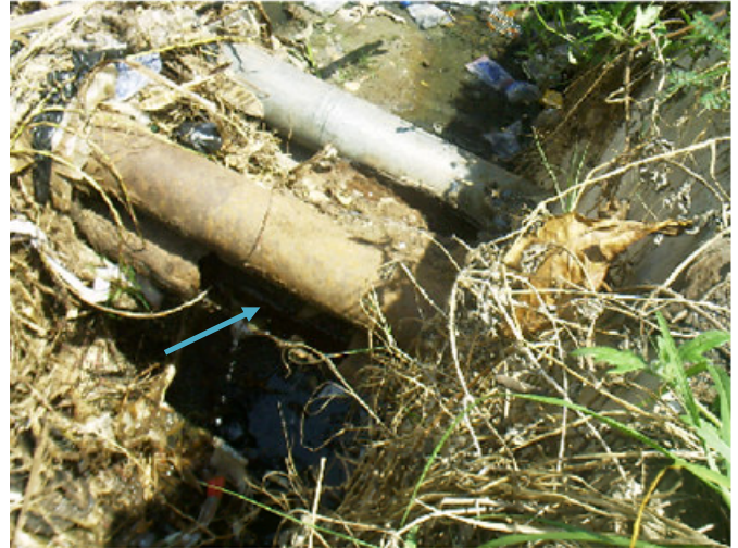
Figure 3. A broken metal distribution pipe (Danquah circle, Accra, 2006). Arrow indicates direction of leakage or breakage on pipe.