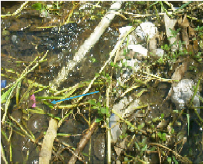
Figure 2. A broken pipe submerged in sewage water (Danquah circle, Accra, 2006). Arrow indicates direction of leakage or breakage on pipe.