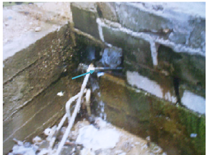
Figure 4. A broken pipe from improper sealing at a joint (New Fadama, Accra, 2006). Arrow indicates direction of leakage or breakage on pipe.