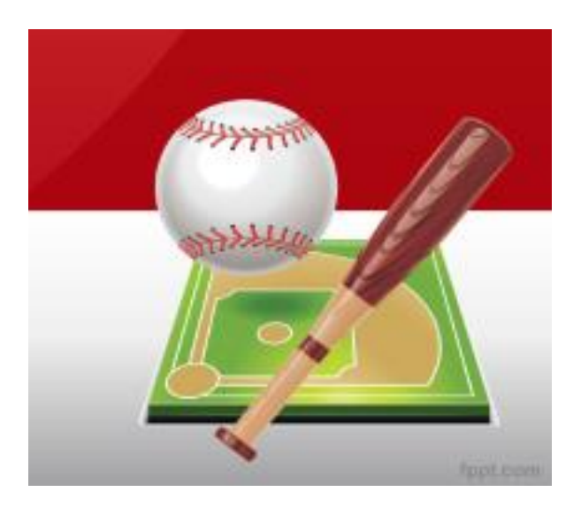
Baseball and Nursing:

How the Game Coaches Us in Spirituality, Self-Care, and Resilience