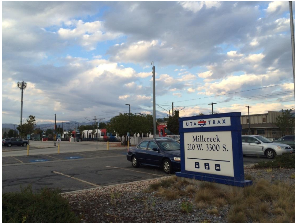
(a) UTA P&R Lot at TRAX Millcreek Station