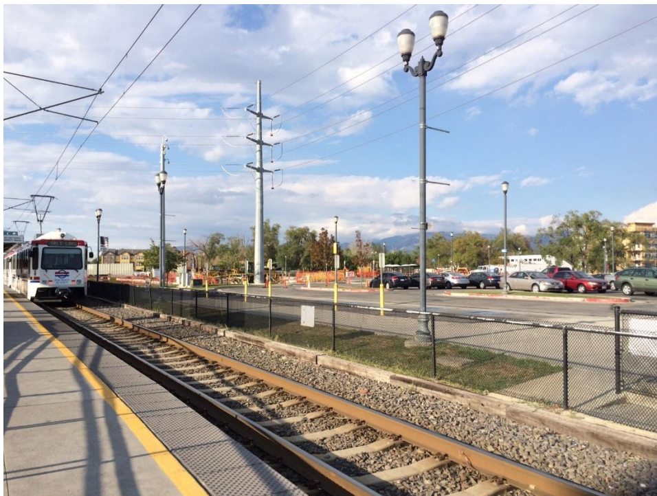
(b) UTA P&R Lot at TRAX Meadowbrook Station