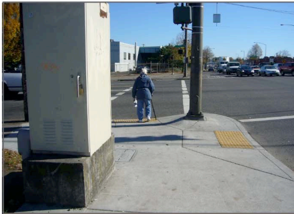
(c) Milwaukie/Powell, north crosswalk, looking east toward channelized turn lane.