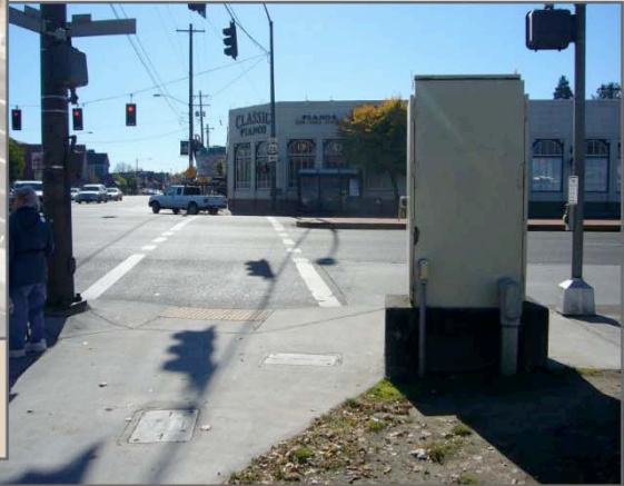
(b) Milwaukie/Powell, west crosswalk, looking south.