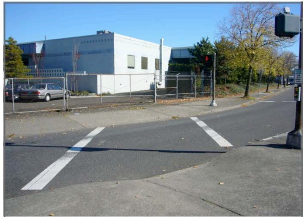
(d) Milwaukie/Powell, channelized turn lane crossing, looking east.