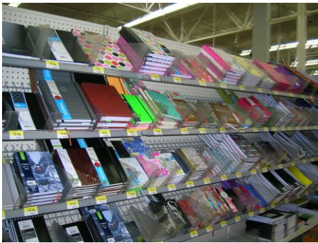
Figure 6. Photo taken in response to prompt of in-store barriers.

Participant 1 chose differently, opting to not purchase the item. When discussing the location of items placed on a high shelf, she noted, “They’re angled. So, if you gonna try to reach ‘em, you’ll fall. So, I just don’t, I just leave ‘em alone.” Here, the participant decided not to purchase the item she desired on the angled shelf because she understood that accessing it may cause her to fall (see Figure 6).