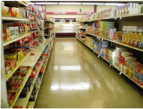
Figure 4. Photo taken in response to prompt of facilitators in store (small local market).

Participant 3 discussed products at a small local market and her photograph that shows a smaller overall height of shelves than one experiences in larger stores: “And it was eye level for me, and I could, you know, I could reach everything.” She also stated: “Yes, I like the way that they labeled things to get.” Another facilitator was the cleanliness of the small local market, as Participant 1 noted, “Well, I thought it was real nice there. I mean, it’s all cleaned up.” This experience was different from those at larger supermarkets, where the participants encountered barriers from stocking crates in the aisles.