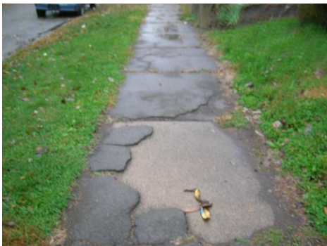
Figure 1. Photo taken as perceived barrier in response to prompt on transportation and community.

These quotes highlight the participants’ frustrations about the changing area, as well as a resolve to remain active members of their changing community. Along with the changes to the community, the participants were frustrated in feeling excluded from city planning (see Figure 1).