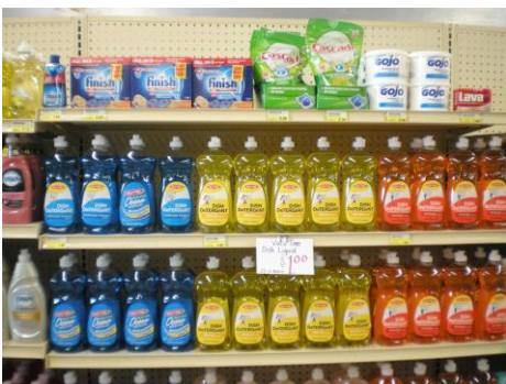
Figure 5. Photo taken of vertical product display as a facilitator in the small local market.

Participant 3 managed to adapt to the above situation, offering, “I had to reach up [laughs] and kinda hold onto it and then ya know brought it down.” She demonstrated as if reaching up with her arm fully extended and with her finger tips scooting the bag forward into her hands, controlling it as it descended. Her preference was indicated in Figure 5, where she indicated that placing like items on shelves vertically allowed her to better access items.