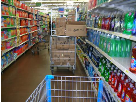
Figure 2. Obstacles in the narrow aisles prevented access to needed items.

vegetables], right there it is. And, right here, now if you wanna go around here to get some, uh, water or somethin', you gotta wait til they move all that before you can get to it. (Participant 2) The participant's experience involved grocery items and a worker's restocking process that took up space and blocked the participant's ability to access desired items.