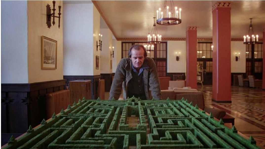
Figure 1. Kubrick, Stanley, Diane Johnson, Jack Nicholson, Shelley Duvall, Danny Lloyd, Scat Man Crothers, Barry Nelson, et al. 2007. Stanley Kubrick's The Shining . Burbank, CA: Distributed by Warner Home Video.