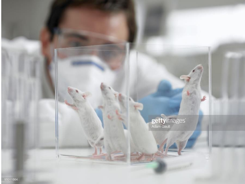
Figure 3. Scientist watching mice in laboratory. "Scientist Watching Mice in Laboratory." Digital image. Getty Images. Accessed April 07, 2019. https://www.gettyimages.com/detail/photo/scientist-watching-mice-in-laboratory-royalty-free-image/95011864 .