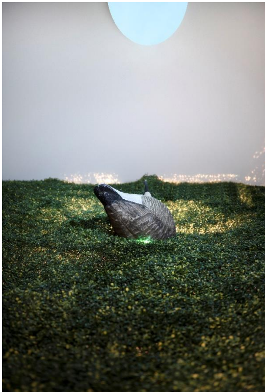
Figure 2. Banholzer, Jacob. Do Geese Dream of a Down Filled Heaven?