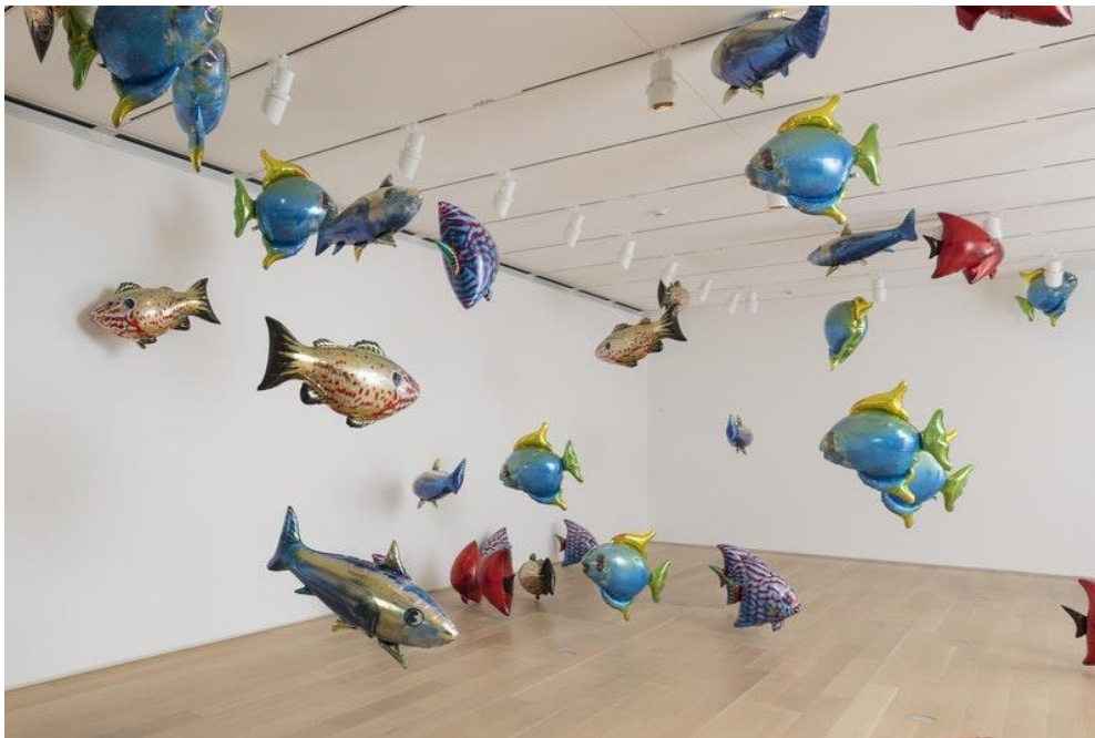
Figure 6. Parreno, Philippe, Mylar Balloons, Installation view of My Room Is Another Fish Bowl . Art Institute of Chicago, February 3–April 15, 2018. Chicago Institute of Art. Accessed April 2, 2019. https://www.artic.edu/exhibitions/8919/philippe-parreno-two-automatons-for-one-duet-my-room-is-another-fish-bowl-19962016-and-with-a-rhythmic-instinct-to-be-able-to-travel-beyond-existing-forces-of-life-2014 .