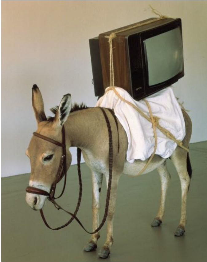
Figure 7. Cattelan, Maurizio, IF A TREE FALLS IN THE FOREST AND THERE IS NO ONE AROUND IT, DOES IT MAKE A SOUND? 1998. Taxidermized donkey, television, rope, blanket. 150 x 154 x 46 cm | 59 1/16 x 60 5/8 x 18 1/8 inch, Unique. Perrotin Gallery. Accessed April 2, 2019. https://www.perrotin.com/artists/Maurizio_Cattelan/2/if-a-tree-falls-in-the-forest-and-there-is-no-one-around-it-does-it-make-a-sound/5450 .