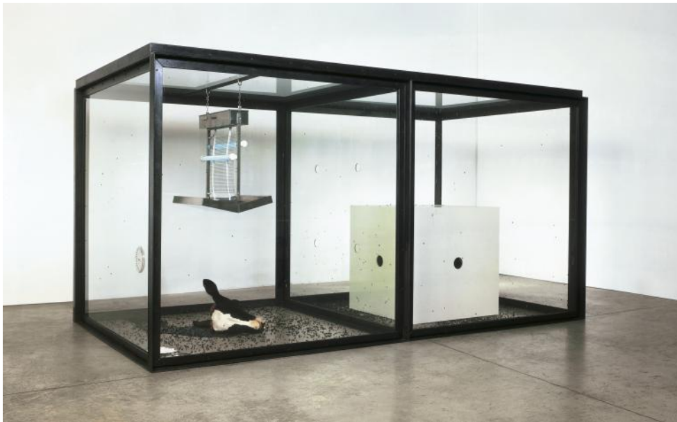
Figure 4. Hirst, Damien, A Thousand Years . 1990. Glass, steel, silicone rubber, painted MDF, Insect-O-Cutor, cow's head, blood, flies, maggots, metal dishes, cotton wool, sugar and water 2075 x 4000 x 2150 mm | 81.7 x 157.5 x 84.7 in